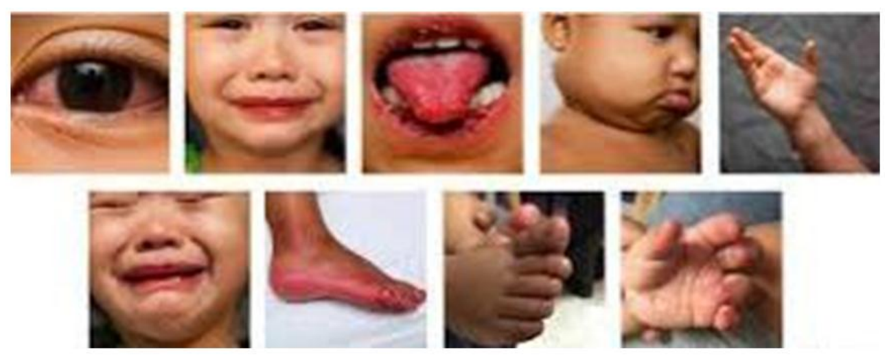
Fig 1: Clinical presentation of disease.

KEYWORDS : Kawasaki disease, (Cardiac) MRI, Coronary aneurysm, Cardiac imaging, (IVIG), coronary artery lesion.