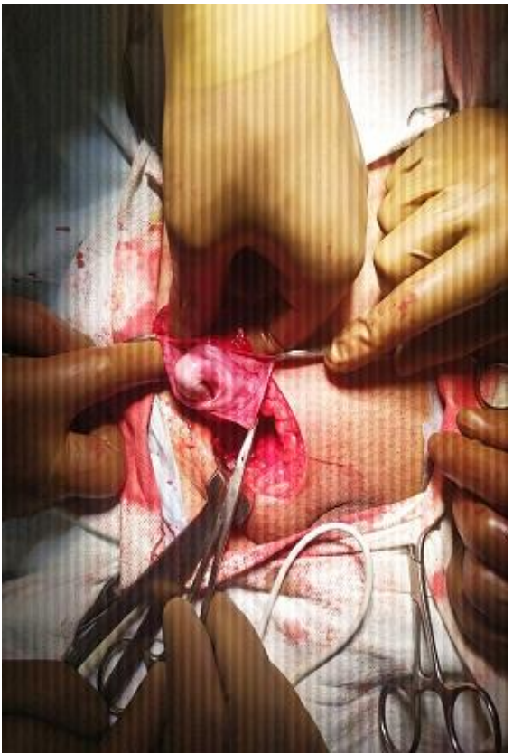
Fig. 2: Opening of the sac revealed an inflammed appendix as the content with adhesion to the wall of the sac.