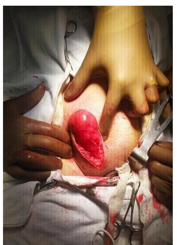
Fig. 1: Visualising the indirect inguinal hernia sac.

A 55 year old gentleman who had a history of right-sided reducible incomplete inguinal swelling for 6 years, was admitted with complaints of pain over the swelling with anorexia and vomiting since 2 days. There was no history of fever or migratory pain. On per abdominal examination, there was tenderness over the inguinal swelling but there was no rebound tenderness. The swelling was reducible and cough impulse was positive. Bowel sounds were present normally and a per rectal examination revealed normal findings. Rest of the systemic examination was within normal limits. Ultrasound of the abdomen reported normal findings. Laboratory parameters were within normal limits. Abdominal X-ray demonstrated no air fluid levels. Hence, with a diagnosis of right sided, incomplete, indirect inguinal hernia with suspected incarceration, patient was taken up for emergency surgery. Intra operatively there were dense adhesions within the sac, adhesions were released which revealed herniation of appendix into the inguinal canal. Appendix was congested with evidence of inflammation. Hence, in view of inflamed appendix, appendicectomy followed by Bassini herniorraphy was done. Postoperative period was uneventful and patient was discharged on the third day.