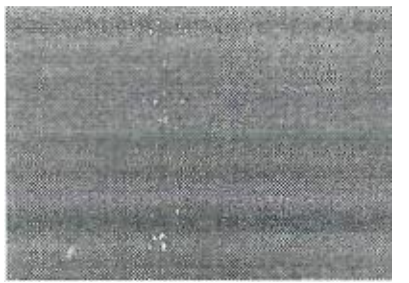
Plate 1: Agarose gel pix showing the amplified 16S rRNA gene bands. Lanes 1-6 show the bands at I500bp while Lane L represents the 100 bp molecular ladder.