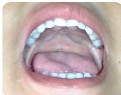
Figure 3: Postoperative 3 months.