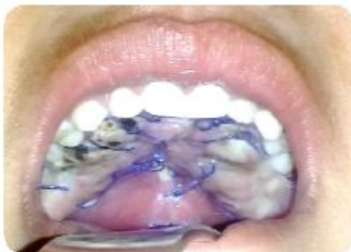
Figure 2: Post Operative 7th Day