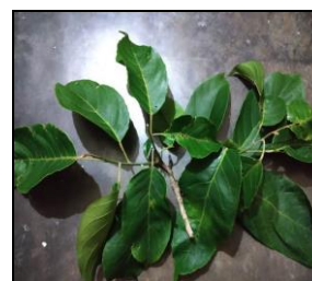
Fig no. 2: Leaves of Ehretia laevis . [3]

Ehretia laevis is a rare Indian herb in the medicinal industry due to its extensive therapeutic properties. It belongs to the Boraginaceae or Borage family. Ehretia laevis is a very valuable medicinal plant which is becoming rare in Maharashtra. It has sacred significance among Hindus. [2]