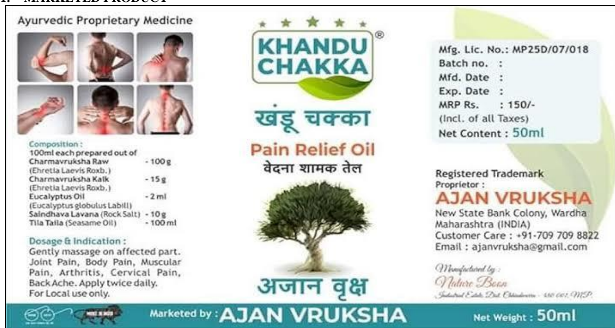
Fig no. 4: Khandu chakka oil.