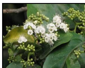
Fig no. 1: Flowers of Ehretia laevis . [2]

Ehretia laevis is a medium-sized tree with dark green leaves ranging from 2-7.8 cm in length and 1.2 to 3.8 cm in width. The plant has obtuse leaves with 5-7 lateral veins and short 2-3 cm, and its bark is uneven and light gray. Ehretia laevis flowers and fruits, which bloom from January to April, are white and can reach up to 8 mm in size. [4]