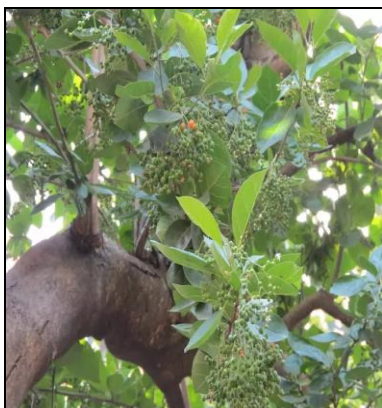
Fig no. 3: Ehretia laevis . [5]