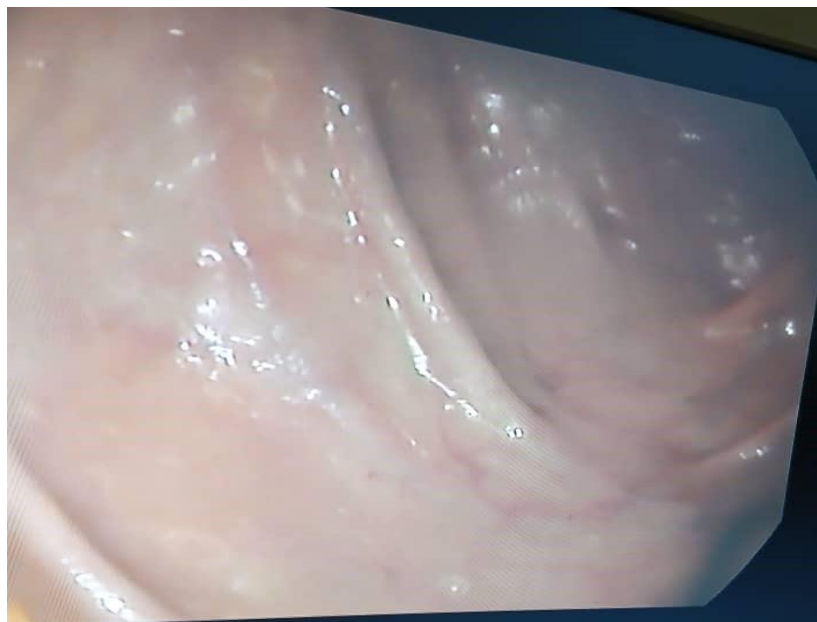
Endoscopic image revealed pan colitis

Histologic slide revealed mucosal infiltration of inflammatory cells, focal areas of crypt abscess admixed with congested vessels.