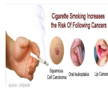
Fig 1: Cigarette smoking and its health impacts.