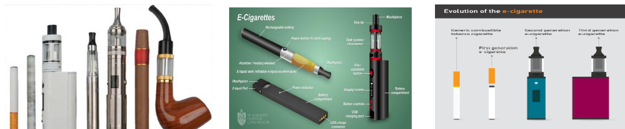
Fig 2: E-Cigarette (Sources: National Academies of Science, Engineering and Medicine, Public Health Consequences of E-Cigarette).

formaldehyde as carcinogens, benzene as volatile organic substance. [37] The users also experienced stress and other distress in different organs, like propylene glycol is amenable for creation airway irritation and intensity of dyspnea. The other chemicals present like cadmium, copper, chromium, nickel cause bronchial, pulmonary irritations, coughing and wheezing, irritations of the mucous membranes in the upper respiratory tract, eyes etc. Those mentioned chemicals also cause lung cancers. Diacetyl can cause difficulty to breathing. [38] A 2020 review found e-cigarettes increase the risk of asthma by 40% and COPD by 50%. [39]