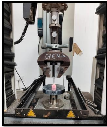
Fig. 5: Testing under universal testing machine(UTM)