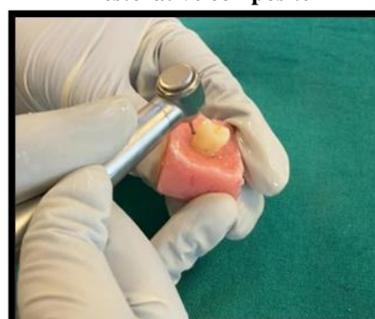
Fig. 4: Class V cavity preparation