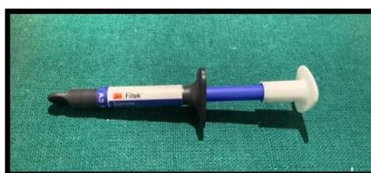
Fig. 2: 3M™ Filtek™ supreme flowable restorative composite