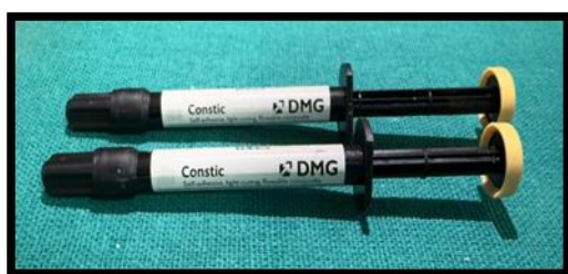
Fig. 1: DMG constic®

Composites were applied according to manufacturer instructions. Shear bond strength was tested using a universal testing machine.