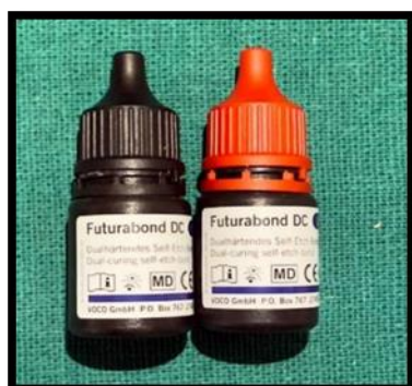
Fig. 3: Futurabond DC bonding agent