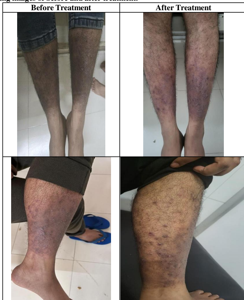
Table no. 10: Showing images of before and after treatment.