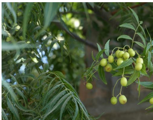
Fig. 4: Neem leaves and fruits.