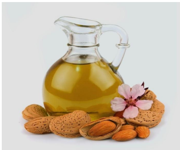
Fig. 21: Almond oil.