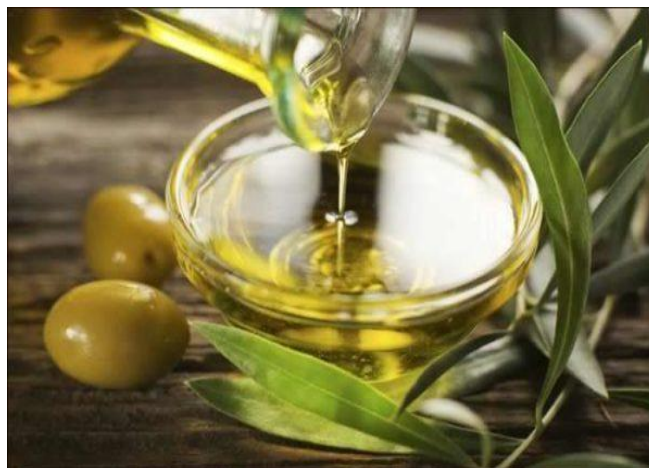
Fig. 13: Olive oil.

This oil is a fixed oil extracted from the fruits of Olea europaea , family Oleaceae. It is used as skin and hair conditioner in cosmetics like shampoos, lotions etc. [44]