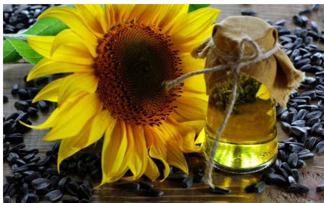
Fig. 12: Sunflower oil.

It is the non-volatile oil expressed from sunflower seeds obtained from Helianthus annuus , family Asteraceae . In cosmetics, it has smoothing properties and is considered noncomedogenic.