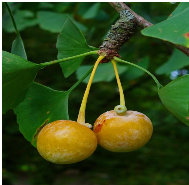
Fig. 15: Ginkgo.

Ginkgo biloba belongs to family Ginkgoaceae. It is best known, as a circulatory tonic, in particular for strengthening the tiny little capillaries to all the organs, but especially to the brain.