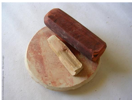
Fig. 10: Chandan.

It is used in face packs and scrubs to remove dead cells on face and the whole body and generate growth of new cells and give a young look. [38]