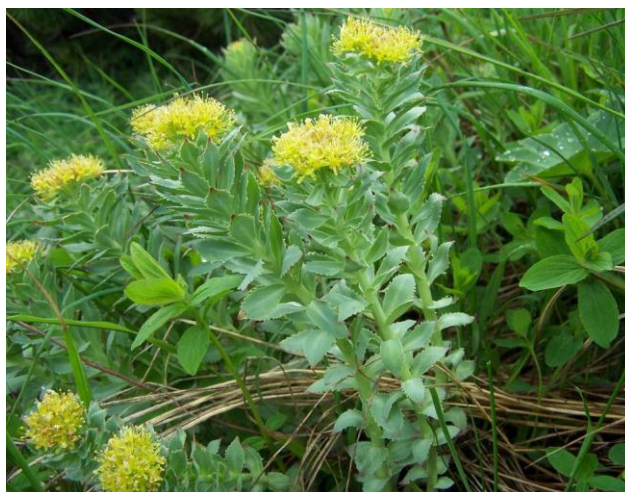
Fig. 16: Rhodiola rosea .

It is commonly known as golden root, roseroot, Aaron's rod, arctic root, king's crown, lignum rhodium, orpin rose. Traditional folk medicine used R. rosea to increase physical endurance, work productivity, resistance to high altitude sickness, and to treat fatigue, depression, anemia, impotence, gastrointestinal ailments, infections, and nervous system disorders. [45]