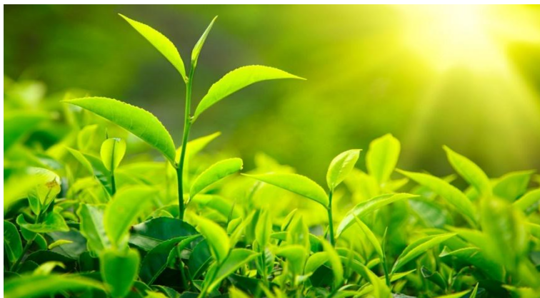
Fig. 19: Green tea.

Green tea is made solely with leaves of Camellia sinesis belonging to family Theaceae. It is a premiere skin protectant. It protects against direct damage to the cell and moderate inflammation.