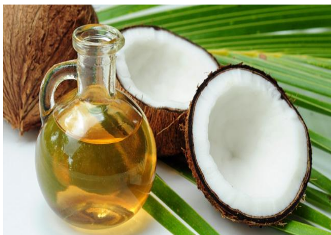
Fig. 11: Coconut oil.

Coconut oil comes from fruit or seed of the coconut palm tree Cocos nucifera , family Arecaceae . Extra virgin coconut oil is excellent as a skin moisturizer and softener.