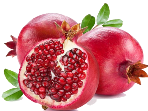
Fig. 24: Pomegranate.

It has antioxidant and anti viral properties and it enhance the effectiveness of topical sunscreens. Pomegranate seed oil has been demonstrated to exhibit chemopreventive activity against skin cancer.