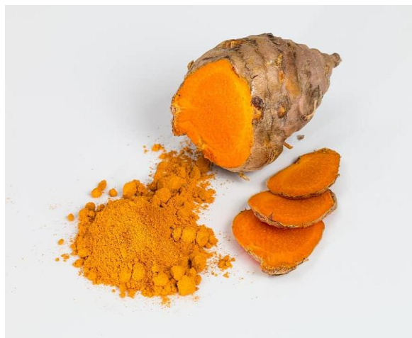
Fig. 9: Turmeric.