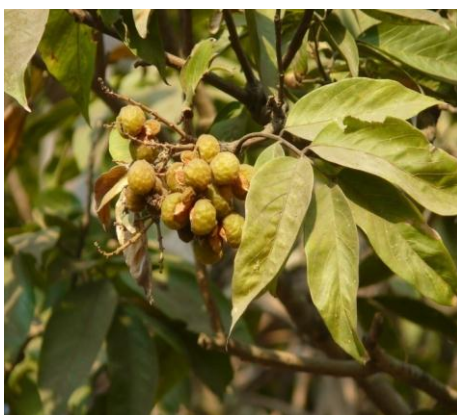
Fig. 5: Reetha fruits.

In India it is used as natural hair and body cleanser.