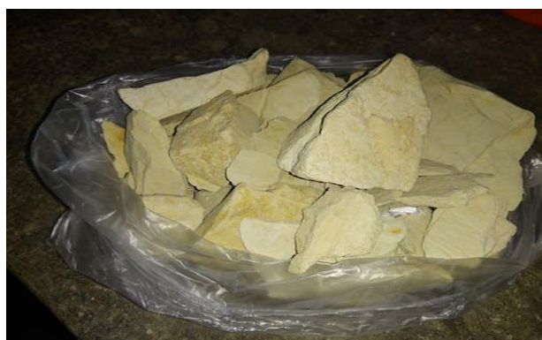
Fig. 8: Multani mitts.

It is mother Nature's own baby powder. It is useful in removing pimple marks, treating sunburn, helps unclog pore, cleanses the skin of flakes and dirt.