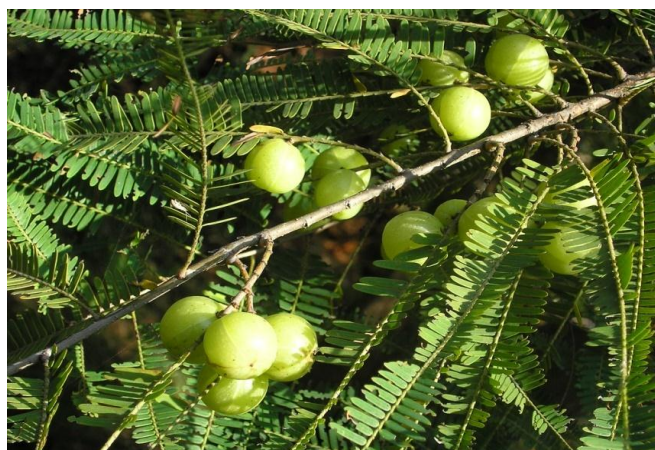
Fig. 1: Amla fruits.

Amla grows throughout the India and the name given to the fruit of a small leafy tree ( Embilicaofficinalis ), this fruit have a high content of vitamin C which is extracted from its seeds it is used as a treatment for hair and scalp problem.