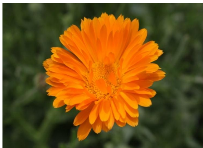
Fig. 20: Calendula.

Calendula in suspension or in tincture is used topically to treat acne, reducing inflammation, controlling bleeding and soothing irritated tissue. [47]