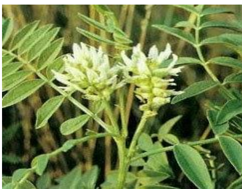
Fig. 25: Liquorice.

Glycyrrhiza glabra extract has been used to treat skin irritation dermatitis, eczema, pruritus, and cysts. It has a chemopreventative action because of glycyrrhizin.