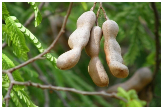
Fig. 23: Tamarind.