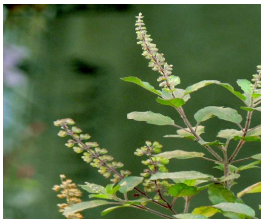
Fig. 6: Tulasi plant.

In India culture, Holy Basil, called Tulasi, is omnipresent. Its role is to cure the herb, the antiviral and many disorders as well.