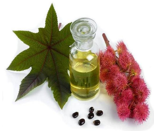
Fig. 22: Castor oil.

This oil is obtained from the seeds of Ricinus communis belonging to the family, Euphorbia, Euphorbiaceae. It is used as an emollient, in the preparation of lipstick, hair oils, creams and lotions. [48]