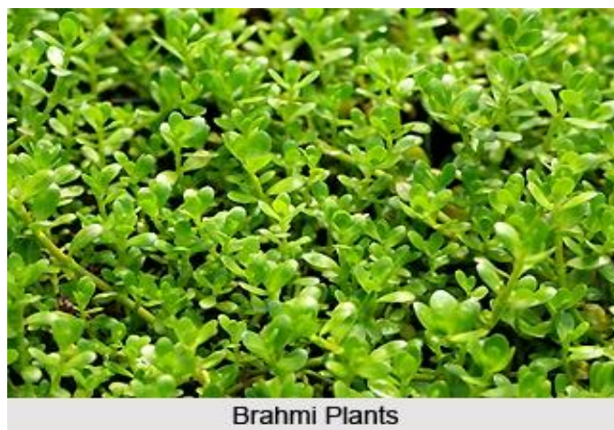
Fig. 2: Brahmi leaves.

It can also be used as a face pack to enhance the skin complexion and also used as hair applicant to make hair shiny and also removes the dandruff and lice in hair.