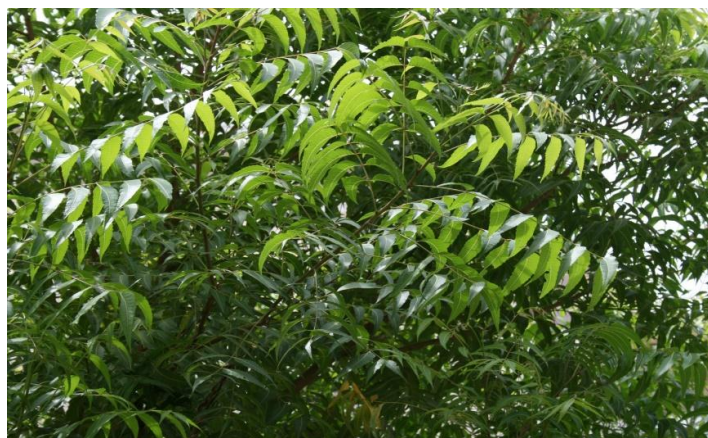
Fig. 18: Neem leaves.

The neem, Azadirachta indica , family Meliaceae has been found to have the properties of a blood purifier, beauty enhancer. The common treatment for the dandruff is neem as it produces antifungal, anti microbial, pain-relieving, and anti-compounds that would treat dandruff. [46]