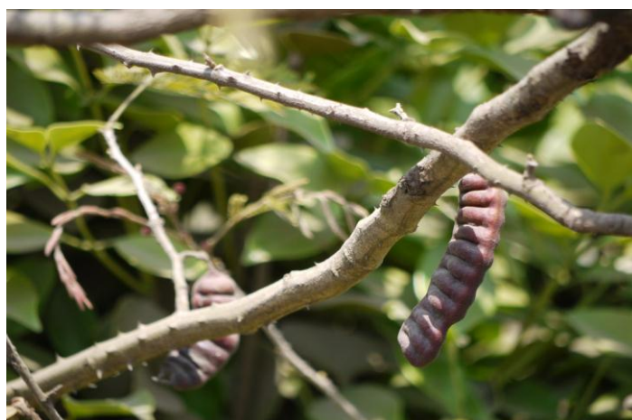
Fig. 3: Shikakai fruits.

It is a small shrub-like tree, which grows in the warm, dry plains of central India. It helps effectively to remove pelts, lices, dirt and oil from the hair.