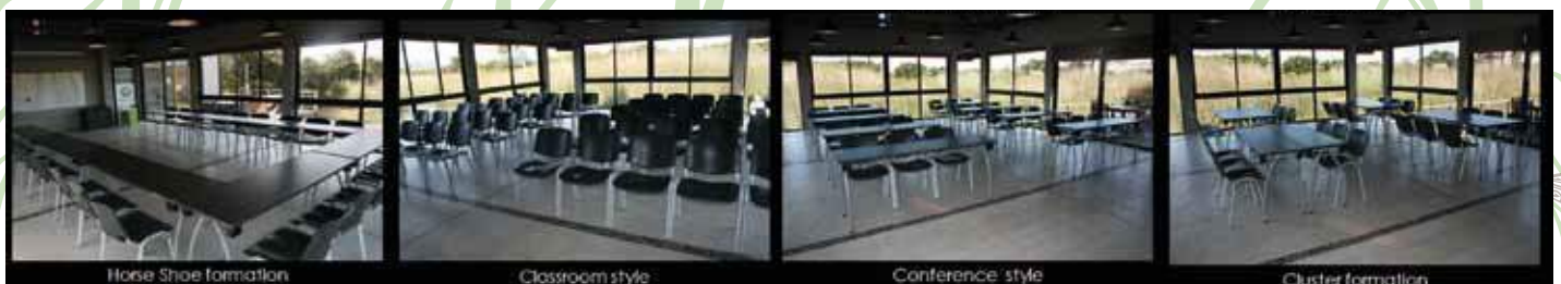
Horse Shoe formation