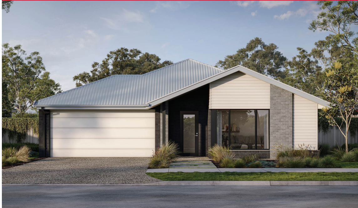
SMITHFIELD 25 | ELEVATE RANGE