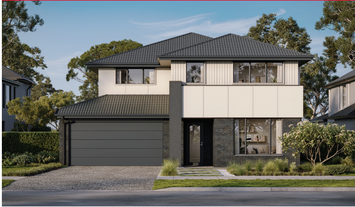
VASSE 24 | EMERGE RANGE