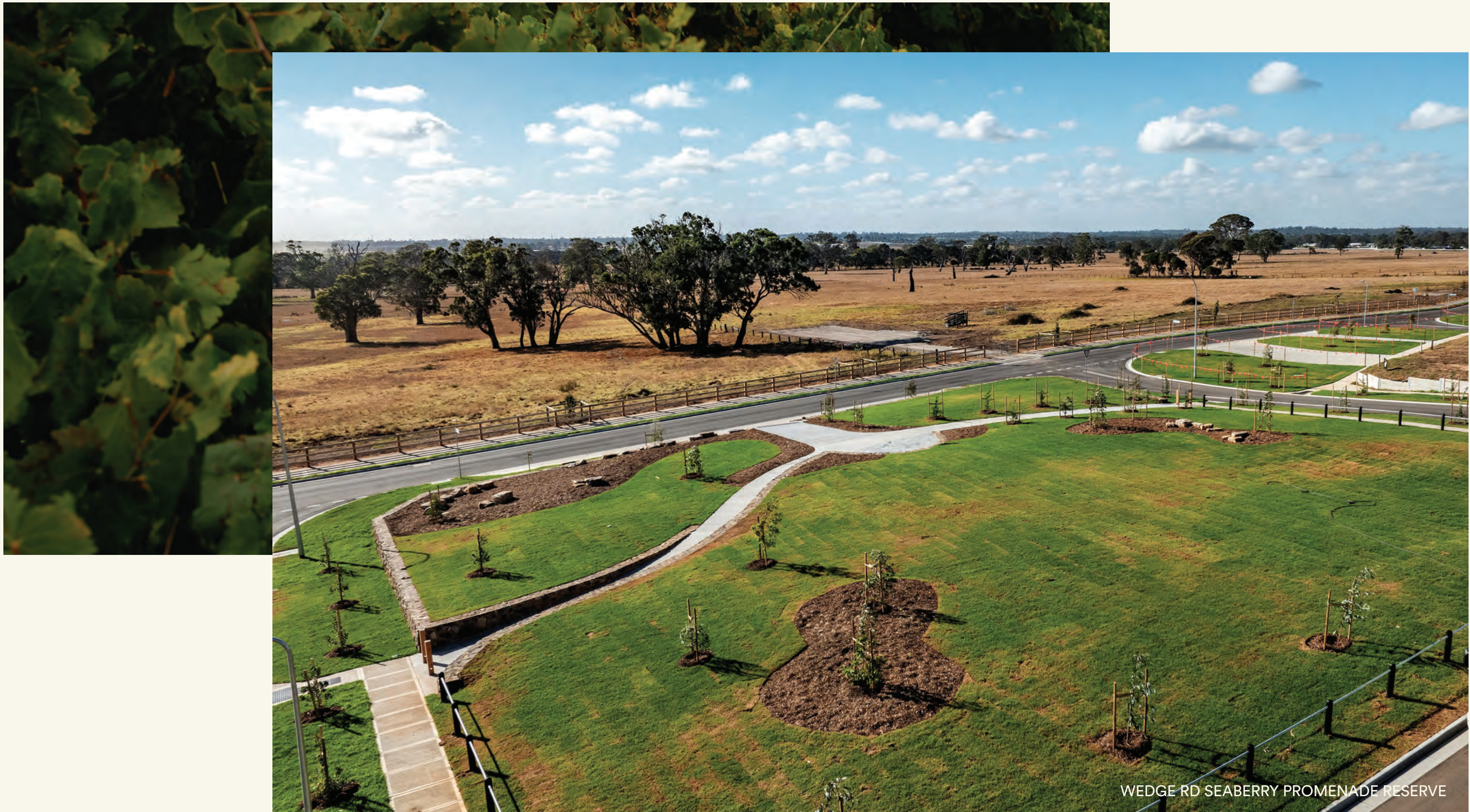
WEDGE RD SEABERRY PROMENADE RESERVE

Wedge Rd is the perfect balance of urban access and natural beauty. Close to the amenities you need and lifestyle you want, Wedge Rd is surrounded by green spaces that invite activity. Neighbourhood pocket parks satisfy the need to feel grass underfoot, while views over the Green Wedge Zone give you the freedom to breathe.