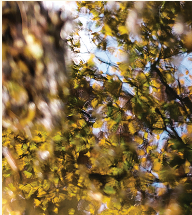
River Valley in Sunshine North by YourLand Developments

NTT UD Australia has been undertaking residential community development projects across Victoria with their mission as follows: "We will contribute to sustainable urban development through our real estate services. What we value most is seeing the satisfaction of our customers and members of the wider public, and bringing smiles to their faces".