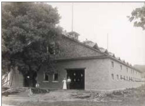
Two people survey the construction of the Cattle Barn. (Undated photo.)

Built in time for the 1914 Fair, the massive Women's and Children Building was considered architecturally ahead of anything ever before erected on the Fairgrounds. The building was torn down in 1980 due to disrepair when the damage