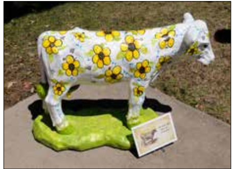
Prize winning concrete cow celebrating 100 years of the Butter Cow in 2011.

an updated and enhanced cooler in the Ag Building; a giant Butter Cow birthday card for Fairgoers to sign; birthday cake at opening ceremonies, a daily amateur butter sculpting contest (Battle of the Butter); and even Fried Butter on-a-stick. There was a huge media turnout for the Fair and the side show of presidential campaigners. Candidates made their stops at the Fair before and after the Iowa Straw Poll in Ames, and media from around the world followed. The result was exposure on national television and major print outlets, the likes of which the Fair could never afford in advertising.