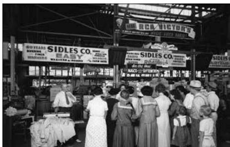
The interior of the Varied Industries Building. (Undated photo.)

The Wright Brothers were under contract for four airplane flights per day during the 1911 Fair. Church ladies opened a day nursery in the Women’s Rest Cottage so mothers could thoroughly enjoy the Fair by leaving their children in good hands. The Baby Health Contest began.