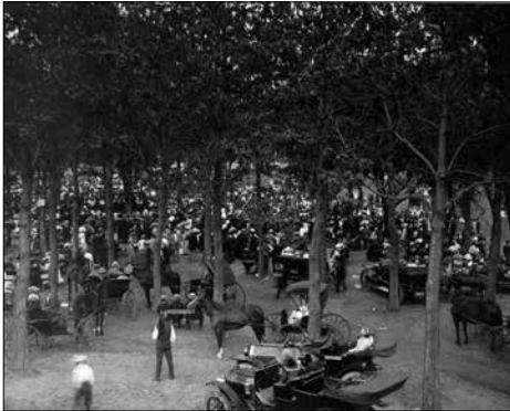
In 1911, some visitors arrived in cars while others still relied on horses and buggies to reach the Fairgrounds.

were purchased for $1,000. Great debate ensued over the size of the track, whether it should be one-half mile or one-mile. When additional appropriations were not granted, the track was made one-half mile. In 1885, Fair officials declared