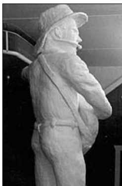
Duffy Lyon's butter sculpture of Garth Brooks at the 1994 Fair.

In 1994, Mother Nature was much more cooperative. The Blue Ribbon Foundation's efforts were beginning to pay off in visible