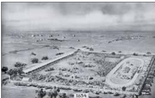
An artist's sketch of the first Iowa State Fair at Fairfield in 1854.

The first Iowa State Fair was held in Fairfield, in southeast Iowa, October 25 to 27, 1854. This was 20 years before America’s great westward movement began, when a