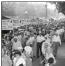
A crowd of people enjoy the 1952 Fair.

Attendance at the 1952 Fair dropped approximately 32,000 under the previous year. Officials contributed the decline to the severe polio epidemic and two days of rain.