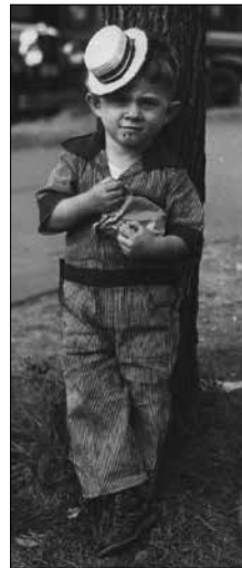
This unidentified boy likely enjoyed “Children’s Day” activities at the Fair. (Undated photo.)

All the leading newspapers had tents on “newspaper row” during the 1890 Fair. There were three courts of tennis tournaments. A division fence was built in the Campgrounds “to prevent any stampede of horses among the campers.” The largest crowd up to that point – 50,000 – attended on September 3. Electric light was used at night for the cost of $3 per lamppost. A landscape architect was hired to furnish plans for “parks, roadways and walks” as well as locations for new buildings.