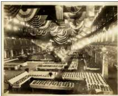
The interior of the Agriculture Building. (Undated photo.)

erected for the next year's Fair. The building is still used today. Camping tents were available to rent and, if ordered ahead, could be pitched and ready for Fairgoers on arrival at the 1905 Fair. An "imposing entrance" of a $400 iron gate was built at Grand Avenue. Registering turnstiles were installed at all