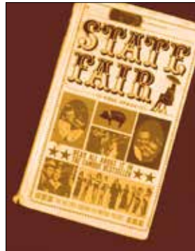
A copy of Phil Stong’s novel State Fair. (Undated photo.)

The introduction of night horse racing on an illuminated track – the first to be seen in the Midwest – was a successful feature of the 1933 Fair. A rodeo and Wild West Stampede also debuted. Officials commented the Fair was the most successful since 1931.