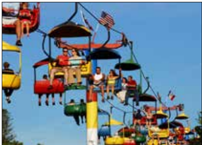
The quarter-mile-long Skyglider has been a favorite attraction since its addition in 1975. A second Skyglider was added in 2003.

Ford spoke to a crowd of more than 10,000 in the Grandstand. The new Sky Glider gave nearly 100,000 people a chance to see the Fair from the air. Thousands walked the new Avenue of Breeds in the Cattle Barn.