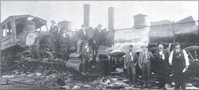
The aftermath of the collision of "Gold Bug" and "Silver Bug" in 1896.