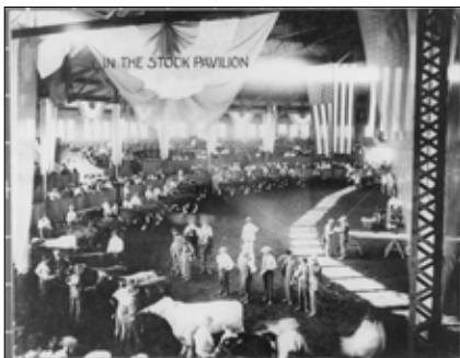
Judges survey a line-up of cattle in the Pavilion. (Undated photo.)

Dust was so deep at the 1901 Fair that officials found it nearly impossible to keep it down. Calls for improvements on the grounds were made including erecting better buildings, installing sewers and paving sidewalks and streets.