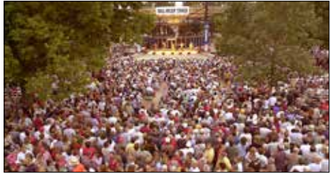
Fairgoers enjoy a performance by the Village People during the 2002 Fair.

The 2002 Fair kicked off a three-year campaign for the Fair's Sesquicentennial in 2004. For the first time Fair attendance topped one million, a remarkable milestone for "The Big One." The approximately $10.2 million renovation of the Varied Industries Building was completed, making it the largest single-level exhibit facility in the state. A lovable blue ribbon named Fairfield debuted as the Fair's mascot. He was named through an online contest on the Fair's website and salutes the Fair's first home in Fairfield. The last Sunday became known as "Extreme Sunday" and featured the Village People on the Anne and Bill Riley Stage, attracting an estimated 10,000 fans. In 2003, a new $1 million Skyglider, stretching 1440 feet, was installed. The new ride connects Gate #10 to the heart of the