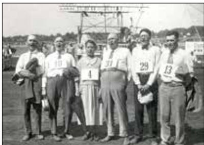
Hog callers at the 1927 Fair.

Ten days of perfect weather made 1927 the most successful in the Fair's 73-year history. The addition of the Education Building to the Grandstand was a great attraction with its second floor art gallery and 90,000 square feet of exhibits. Today, these additions are known as Shoppers' Mart and the Halls of Law and Flame. Special grounds exhibits of radios, farm refrigerators, milking machines, hen houses, washing