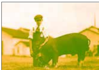
A youngster poses with his State Fair entry. (Undated photo.)

At the 1868 Fair, also held in Clinton, silver medals were awarded instead of cash to “extraordinary” exhibits. A few stands served “whisky” and beer although sales were prohibited. The Board ordered the stands closed. Each day, 2,000 daily programs were distributed on the grounds at 2 p.m. and in the local newspaper.