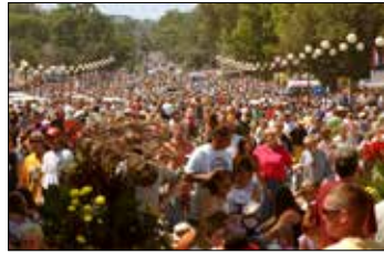
A throng of people crowd the Grand Concourse during the 2004 Fair.

The internationally-acclaimed Iowa State Fair is the single largest event in the state of Iowa and one of the oldest and largest agricultural and industrial expositions in the country. Annually attracting more than a million people from all over the world, the Iowa State Fair in Des Moines is Iowa's great celebration, a salute to the state's best in agriculture, industry, entertainment and achievement. It is the true heartbeat of the Midwest, unequalled and unduplicated.