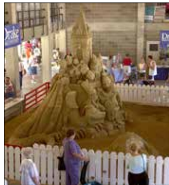
Fairgoers check out a giant sand sculpture in the Cultural Center.

To raise funds for critical Fairgrounds repairs, adult gate admission was raised from $4 to $5 for the 1991 “Blue Ribbon Fun Fest.” An Enormous Equine joined the jumbo livestock judging contests. The Fabric and Threads Department hosted the first Grand