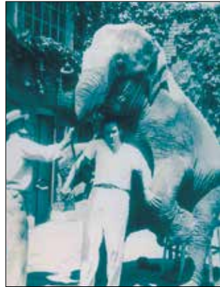
Baby Mine with handlers. (Undated photo.)

the North Pole the spring before. The fireworks spectacular illustrated “A Night in Baghdad,” thrilling Grandstand audiences. While the Fair was successful overall, bad weather and the lateness of the threshing season slowed attendance.