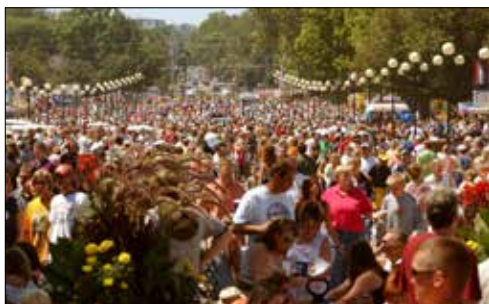
Fairgoers throng the Grand Concourse during the 2004 Fair.

National media visiting included Bill Geist and a crew from CBS News Sunday Morning, USA Today and Monster Nation , which produces television shows for the Discovery Channel, also spent four days on site. ESPN ranked the Fair's debut Outhouse Race among its Top 10 Plays of the Day.