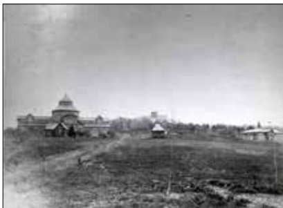
The view from Rock Island Avenue circa 1890. (The buildings pictured no longer exist.)

Throughout its history, the Fair has been a unique institution, serving to educate, inform and entertain people from all walks of life. It is an outstanding agricultural showplace, boasting one of the world's largest livestock shows. Also home to the largest art show in the state, the Fair showcases visual and performing arts with a variety of special exhibits and activities.