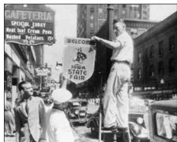
A man hangs a banner promoting the Fair in downtown Des Moines. (Undated photo.)

A new Grandstand record was set when Chicago grossed $129,260 – more than any single show in the history of all fairs in the United States and Canada at that time. Other Grandstand crowd-pleasers included Charlie Rich, Redd Foxx and Academy Award-winner Liza Minelli.