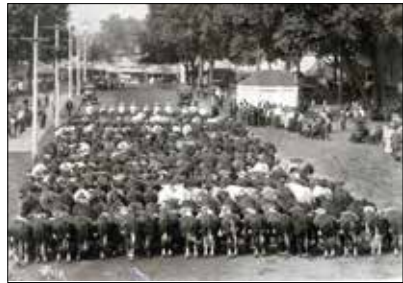
Baby Beeves Parade at the 1923 Fair.

Rain on six of the eight days of the 1923 Fair deterred visitors. The new Baby Beef Barn (now part of the Sheep Barn) provided housing for more than 500 head, the largest display of baby beeves ever assembled by the Iowa Boys and Girls Clubs. For the first time in history, the “exact pulling power of a team of horses could be measured accurately and scientifically with the newly invented ‘horse power dynamometer’ perfected by the Engineering Department of the Iowa State College in Ames,” officials noted. A new feature was added to the program in front of the Grandstand: the “Loud Speaker.” The big attraction was the “Tokyo” fireworks display depicting the 1923 earthquake.