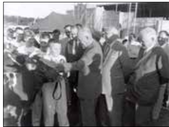
President Dwight D. Eisenhower and former President Herbert Hoover meet with 4-H members during the 1954 Fair.

The Fair marked its centennial in 1954. A horse caravan consisting of 509 people, 471 horses and 40 covered wagons traveled from Fairfield (the location of the first Fair) to the Fairgrounds in Des Moines to officially open the Fair. President Dwight D. Eisenhower and former President Herbert Hoover visited as well. A 20-foot time capsule, called the Centurion, was erected. The collection inside will give Fairgoers in 2054 a good look at Iowa life a century ago.