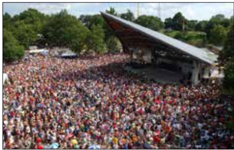
One of the largest free entertainment crowds ever – estimated at more than 10,000 – enjoyed Disney sensation Raven on the new Susan Knapp Amphitheater during the 2006 Fair.