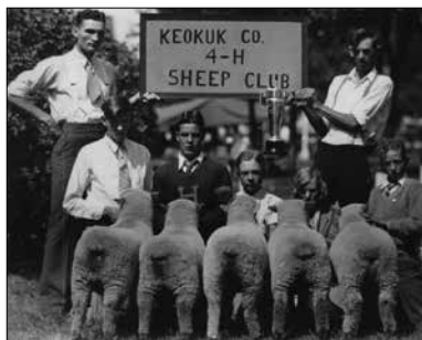
Members of the Keokuk County 4-H Sheep Club pose with their winning entries. (Undated photo.)