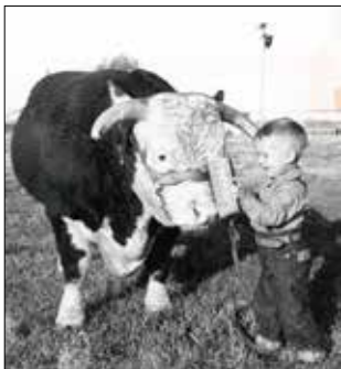
A young boy grooms his Hereford bull for competition. (Undated photo.)

The Legislature appropriated $2,000 in funds to the 1856 Fair held in Muscatine. Officials exulted in attendance on one day tallying 15,000 people. The 1857 Fair was also held in Muscatine. At the first plowing contest, each of the seven contestants plowed a one-fourth acre land in “old, loose and sandy” soil, turning a furrow at least six inches deep. The shortest time required was 48 minutes and the longest 61