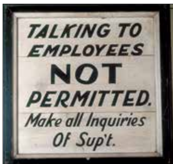
Sign posted in the Maintenance Department in the 1930s.

The 1882 Fair was the first to run eight days, up from five. Large signs stating “No smoking allowed” and “Beware of thieves and pickpockets” were printed and placed in prominent places in exhibition halls. Boys were allowed to sell candy and lemonade in the amphitheater. U.S. Commissioner of Agriculture George B. Loring spoke at opening ceremonies.