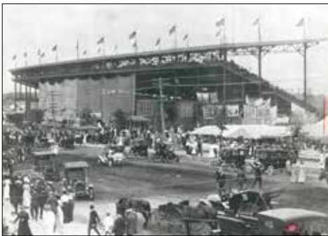
A view of the Grand Concourse. (Undated photo.)

"Work and Prosper" was the theme of the 1921 Fair. Fairgoers could spend hours marveling at exhibits, lectures and demonstrations in the Women and Children's Building and still not see all that was offered. Items of interest ranged from a proper