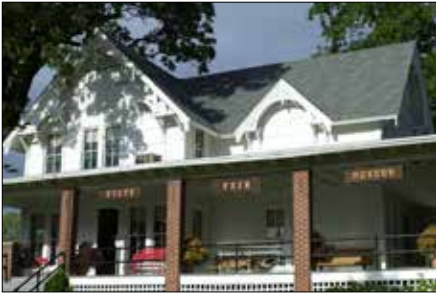
The former Polk County Headquarters Building was transformed into the State Fair Museum in 1982.

New attractions in 1982 included the State Fair Museum as well as a new free entertainment stage west of the Cultural Center (now the MidAmerican Energy Stage). Textile and food exhibits were divided and the Food Department moved into newly-refurbished quarters in the Family Center (now the Maytag Family Theaters).