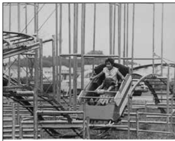
Two young girls take a wild ride on the Midway. (Undated photo.)

Four major Grandstand events were cancelled during the 1979 Fair due to six days of rain. Sixty horses and riders plus five mule-drawn covered wagons left Fairfield on a four-day, 112-mile trek to Des Moines in commemoration of the 125th anniversary of the Fair. Internationally-acclaimed sculptor Al Kidwell was artist-in-residence at the Cultural Center.