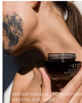
INSTANT MIRACLE RECOVERY MUD MASK No. 806 | 50 ml