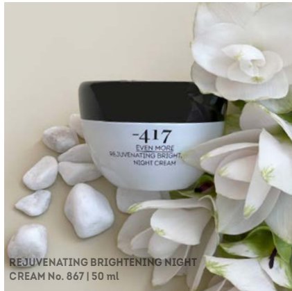
REJUVENATING BRIGHTENING NIGHT CREAM No. 867 | 50 ml

How To Use: While taking a deep breath, inhaling deeply for three seconds, apply lotion generously. Pause. Focus on your breath, close your eyes and exhale slowly for six seconds. While inhaling again, start to massage in and as you exhale, drop your hands, relax, close your eyes. Repeat process as many times as desired in order for the lotion to be fully and beneficially absorbed on skin.