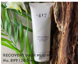
RECOVERY HAIR MUD MASK No. 899 | 200 ml

How To Use: While taking a deep breath, inhaling deeply for three seconds, apply lotion generously. Pause. Focus on your breath, close your eyes and exhale slowly for six seconds. While inhaling again, start to massage in and as you exhale, drop your hands, relax, close your eyes. Repeat process as many times as desired in order for the lotion to be fully and beneficially absorbed on skin.