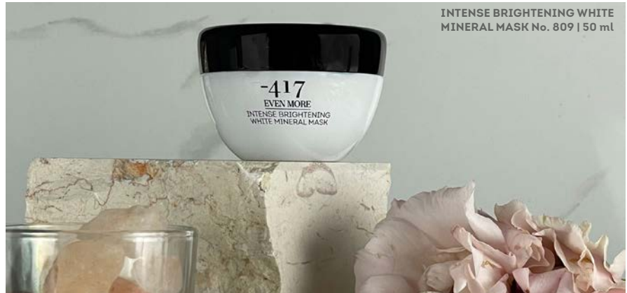
INTENSE BRIGHTENING WHITE MINERAL MASK No. 809 | 50 ml

How To Use: While taking a deep breath, inhaling deeply for three seconds, apply to cleansed face while avoiding the eye area. Pause. Focus on your breath, close your eyes and exhale slowly for six seconds. While exhaling, drop your hands, relax, close your eyes. Keep the mask on for 7 to 10 minutes. Take this time to relax, light a candle, meditate and breathe conscious deep breaths in order for the mask to be fully and beneficially absorbed on skin. Then rinse away thoroughly with lukewarm water, breathing in and out.