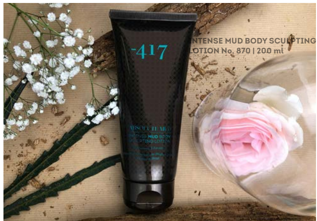
INTENSE MUD BODY SCULPTING LOTION No. 870 | 200 ml