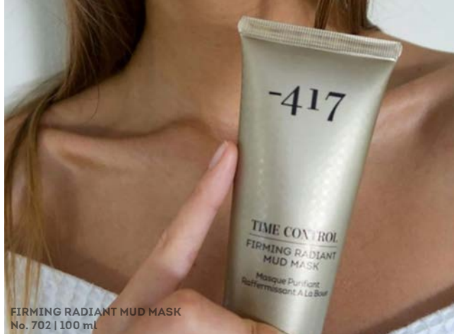
FIRMING RADIANT MUD MASK No. 702 | 100 ml

How To Use: While taking a deep breath, inhaling deeply for three seconds, apply serum evenly to clean, dry skin twice daily for all facial types. Pause. Focus on your breath, close your eyes and exhale slowly for six seconds. While inhaling again, start to gently massage in the serum and on the exhale, drop your hands, relax, close your eyes. Repeat process as many times as desired in order for the serum to be fully and beneficially absorbed on skin. Finish routine followed by your favorite -417 cream.