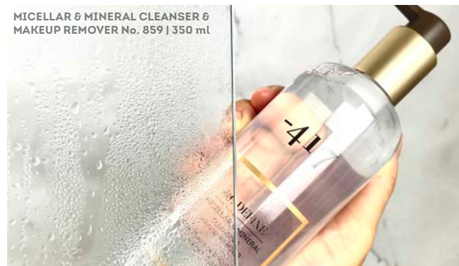
MICELLAR & MINERAL CLEANSER & MAKEUP REMOVER No. 859 | 350 ml