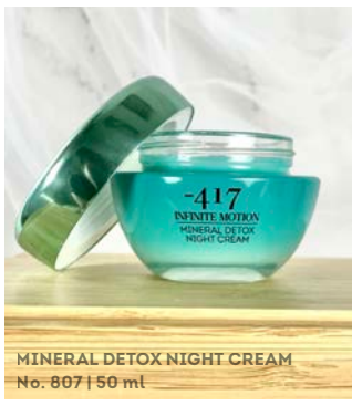
MINERAL DETOX NIGHT CREAM No. 807 | 50 ml