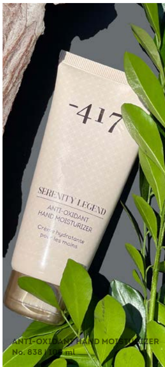
ANTI-OXIDANT HAND MOISTURIZER No. 838 | 100 ml