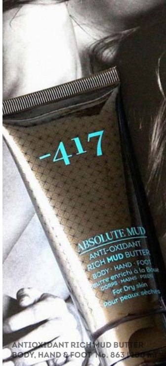
ANTIOXIDANT RICH MUD BUTTER BODY, HAND & FOOT No. 863 | 100 ml