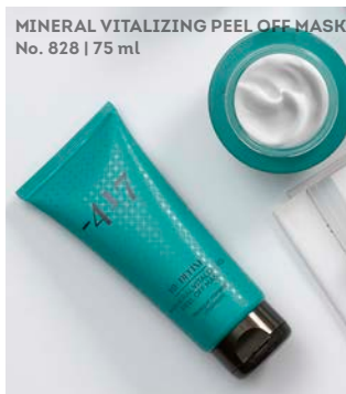
MINERAL VITALIZING PEEL OFF MASK No. 828 | 75 ml