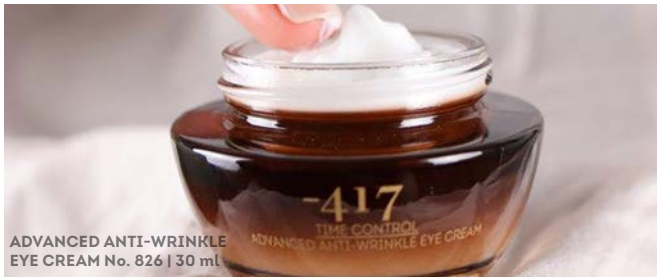
ADVANCED ANTI-WRINKLE EYE CREAM No. 826 | 30 ml

How To Use: While taking a deep breath, inhaling deeply for three seconds, apply serum evenly to clean, dry skin twice daily for all facial types. Pause. Focus on your breath, close your eyes and exhale slowly for six seconds. While inhaling again, start to gently massage in the serum and on the exhale, drop your hands, relax, close your eyes. Repeat process as many times as desired in order for the serum to be fully and beneficially absorbed on skin. Finish routine followed by your favorite -417 cream.