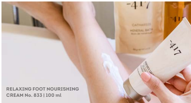
RELAXING FOOT NOURISHING CREAM No. 833 | 100 ml