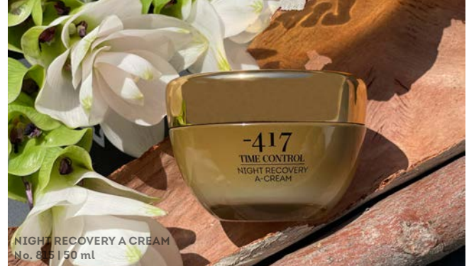
NIGHT RECOVERY A CREAM No. 815 | 50 ml

How To Use: While taking a deep breath, inhaling deeply for 3 seconds, apply a thin layer of cream on cleansed face and neck. Pause. Focus on your breath, close your eyes and exhale slowly for 6 seconds. While inhaling again, start to gently massage in & on the exhale, drop your hands, relax, close your eyes. Repeat process as many times as desired in order for the cream to be fully & beneficially absorbed on skin.