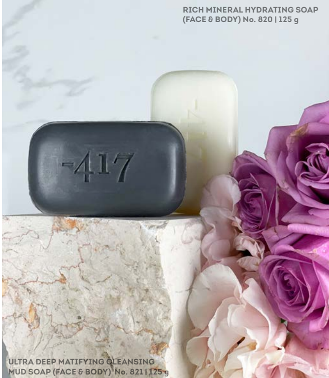
ULTRA DEEP MATIFYING CLEANSING MUD SOAP (FACE & BODY) No. 821 | 125 g