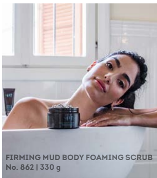
FIRMING MUD BODY FOAMING SCRUB No. 862 | 330 g

How To Use: While taking a deep breath, inhaling deeply for three seconds, apply lotion generously. Pause. Focus on your breath, close your eyes and exhale slowly for six seconds. While inhaling again, start to massage in and as you exhale, drop your hands, relax, close your eyes. Repeat process as many times as desired in order for the lotion to be fully and beneficially absorbed on skin.