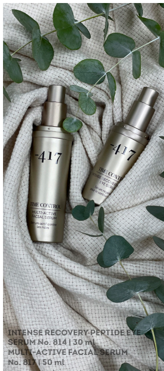
INTENSE RECOVERY PEPTIDE EYE SERUM No. 814 | 30 ml MULTI-ACTIVE FACIAL SERUM No. 817 | 50 ml