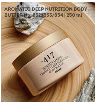
AROMATIC DEEP NUTRITION BODY BUTTER No. 852/853/854 | 250 ml