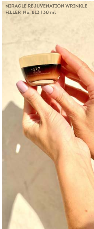
MIRACLE REJUVENATION WRINKLE FILLER No. 813 | 30 ml

How To Use: While taking a deep breath, inhaling deeply for three seconds, apply to cleansed face while avoiding the eye area. Pause. Focus on your breath, close your eyes and exhale slowly for six seconds. While exhaling, drop your hands, relax, close your eyes. Keep the mask on for 15 minutes. Take this time to relax, light a candle, mediate and breathe conscious deep breaths in order for the mask to be fully and beneficially absorbed on skin. Then rinse away thoroughly with lukewarm water, breathing in and out.