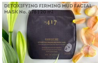
DETOXIFYING FIRMING MUD FACIAL MASK No. 876 | 20 ml