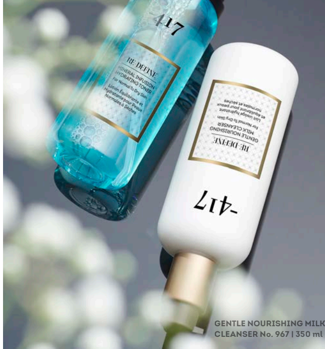
GENTLE NOURISHING MILK CLEANSER No. 967 | 350 ml

MINERAL INFUSION HYDRATING TONER No. 968 | 350 ml