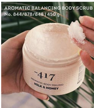
AROMATIC BALANCING BODY SCRUB No. 844/878/848 | 450 g