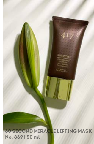
60 SECOND MIRACLE LIFTING MASK No. 869 | 50 ml

How To Use: While taking a deep breath, inhaling deeply for three seconds, apply a thin layer of cream on cleansed face and neck. Pause. Focus on your breath, close your eyes and exhale slowly for six seconds. While inhaling again, start to gently massage in and on the exhale, drop your hands, relax, close your eyes. Repeat process as many times as desired in order for the cream to be fully and beneficially absorbed on skin.