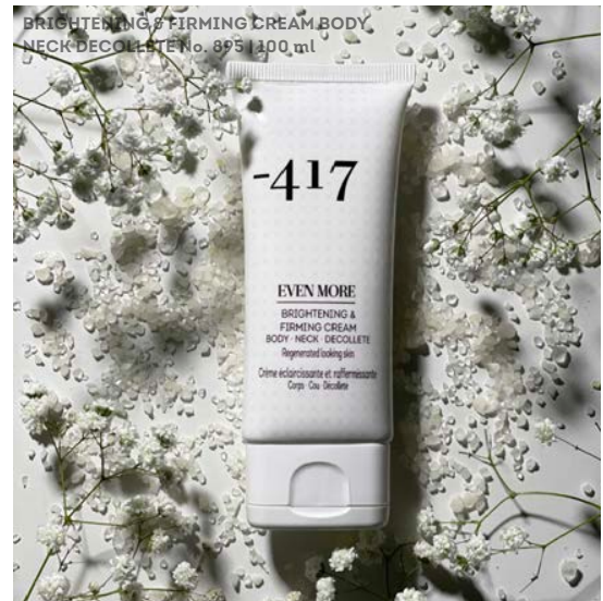
BRIGHTENING & FIRMING CREAM BODY NECK DECOLLETE No. 895 | 100 ml