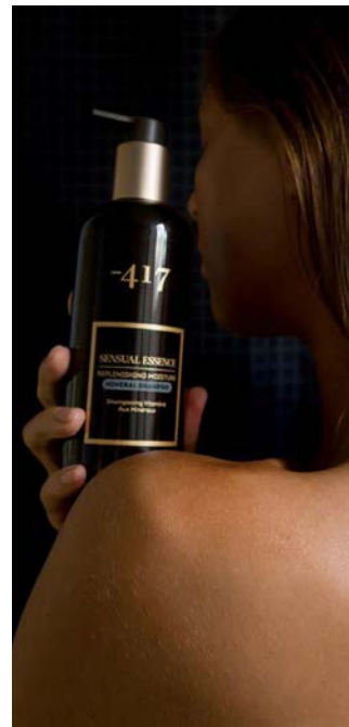
REPLENISHING MOISTURE MINERAL SHAMPOO No. 5806 | 350 ml

How To Use: While taking a deep breath, inhaling deeply for three seconds, apply sufficient amount of product onto wet hair. Pause. Focus on your breath, close your eyes and exhale slowly for six seconds. While inhaling again, start to gently massage into a lather and on the exhale, drop your hands, relax, close your eyes. Repeat process as many times as desired in order for the hair care benefits to be fully and beneficially absorbed onto hair and scalp and rinse away thoroughly.