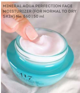
MINERAL AQUA PERFECTION FACE MOISTURIZER (FOR NORMAL TO DRY SKIN) No. 860 | 50 ml