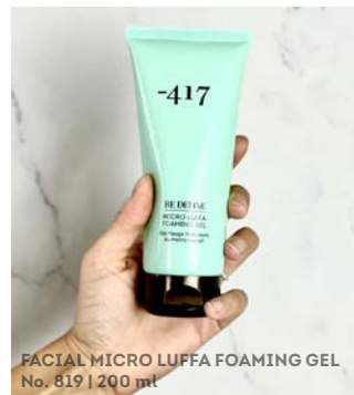
FACIAL MICRO LUFFA FOAMING GEL No. 819 | 200 ml

How To Use: While taking a deep breath, inhaling deeply for three seconds, apply with clean fingertips or with a cotton pad. Pause. Focus on your breath, close your eyes and exhale slowly for six seconds. While inhaling again, cleanse the face with circular motions and on the exhale, drop your hands, relax, close your eyes. Repeat process as many times as desired in order for the cleanser to be fully and beneficially absorbed on skin.