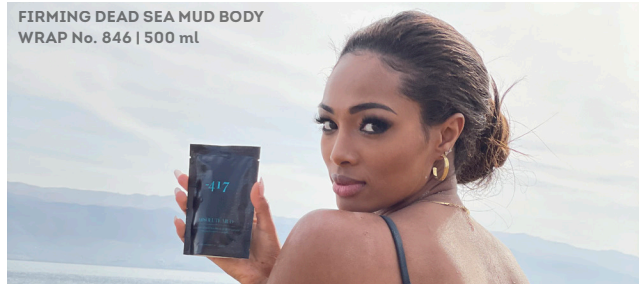
FIRMING DEAD SEA MUD BODY WRAP No. 846 | 500 ml

How To Use: While taking a deep breath, inhaling deeply for three seconds, apply lotion generously. Pause. Focus on your breath, close your eyes and exhale slowly for six seconds. While inhaling again, start to massage in and as you exhale, drop your hands, relax, close your eyes. Repeat process as many times as desired in order for the lotion to be fully and beneficially absorbed on skin