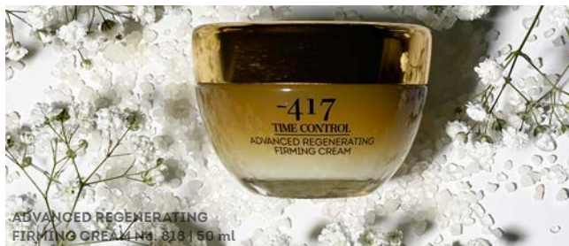
ADVANCED REGENERATING FIRMING CREAM No. 818 | 50 ml