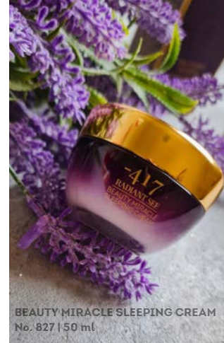
BEAUTY MIRACLE SLEEPING CREAM No. 827 | 50 ml