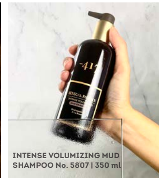
INTENSE VOLUMIZING MUD SHAMPOO No. 5807 | 350 ml