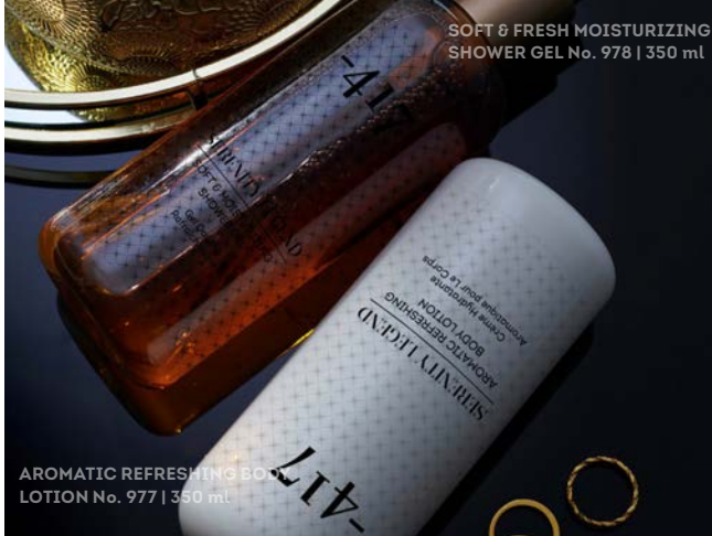
SOFT & FRESH MOISTURIZING SHOWER GEL No. 978 | 350 ml