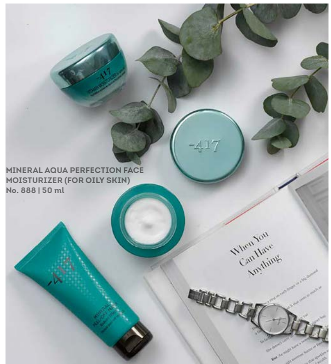
MINERAL AQUA PERFECTION FACE MOISTURIZER (FOR OILY SKIN) No. 888 | 50 ml