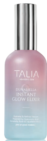
Full Size 100ml e 3.4 fl. oz