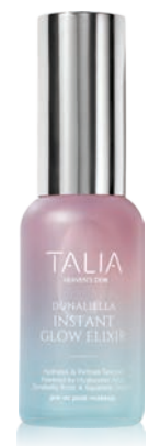
Travel Size 30ml e 1.02 fl. oz