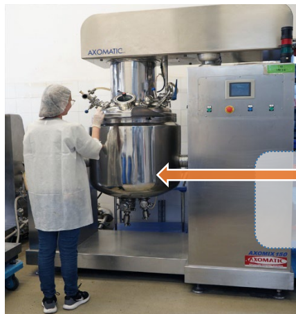
Scale Up 150 lit.