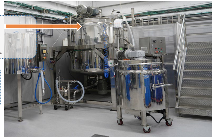
Macro Volume 3000 lit.