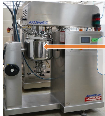
Pilot 30 lit.

Once individual product specifications are confirmed on the basis of a lab size batch - we can scale up to real production from the smallest pilot volume of only 30 liters and up to 3000 liters , when all intermediate vessels ( 150 L. -250 L.- 350 L.- 500 L.- 1000L. ) are state of the art vacuum stainless steel double jacketed reactors, each equipped with full temperature control ; variable speed mixers and homogenizers . Specialized equipment to obtain high quality finished products with repetitive results. This versatility in our production facility gives our customers maximal flexibility regarding MOQ allowing them to gradually increase their batch sizes without pressure and according to their real growth .