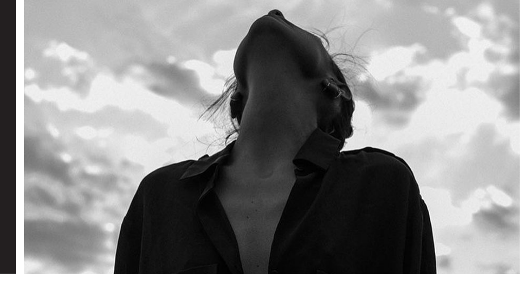
-417 Beauty you can sense