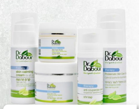
Skin Health Product