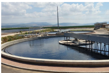
Municipal Waste Water Treatment