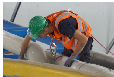
Operation and Maintenance (O&M)