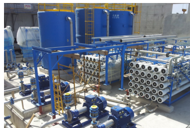
Industrial Water Treatment