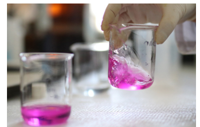
Chemicals for Industrial Applications