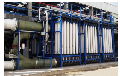
Industrial Waste Water Treatment