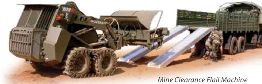
Mine Clearance Flail Machine