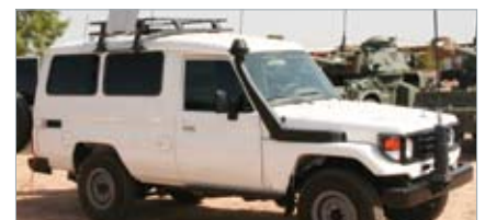
Command and Control Vehicle