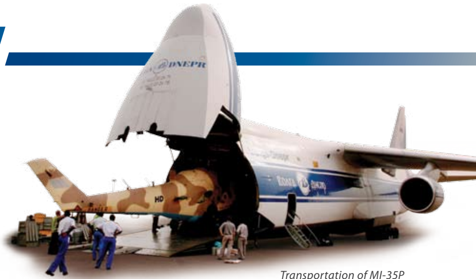
Transportation of MI-35P

All equipment supplied by A.D. Consultants undergoes vigorous testing and inspection, and all services are closely supervised by specialists who accompany customers from project implementation to final confidence in the project's success.