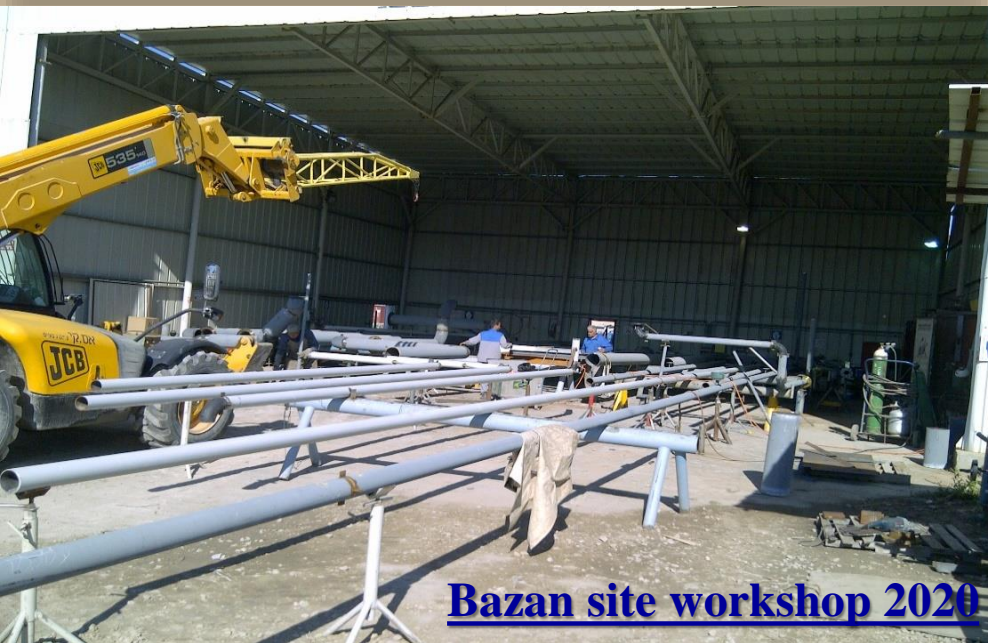
Bazan site workshop 2020

Equipment and structural steel erection.