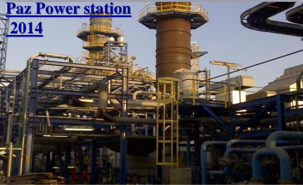
Paz Power station 2014

Our company implemented the contract for – Fabrication, erection of piping and mechanical systems.