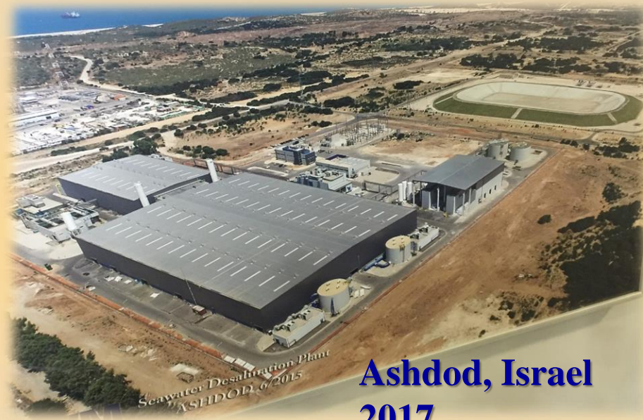
Ashdod, Israel 2017