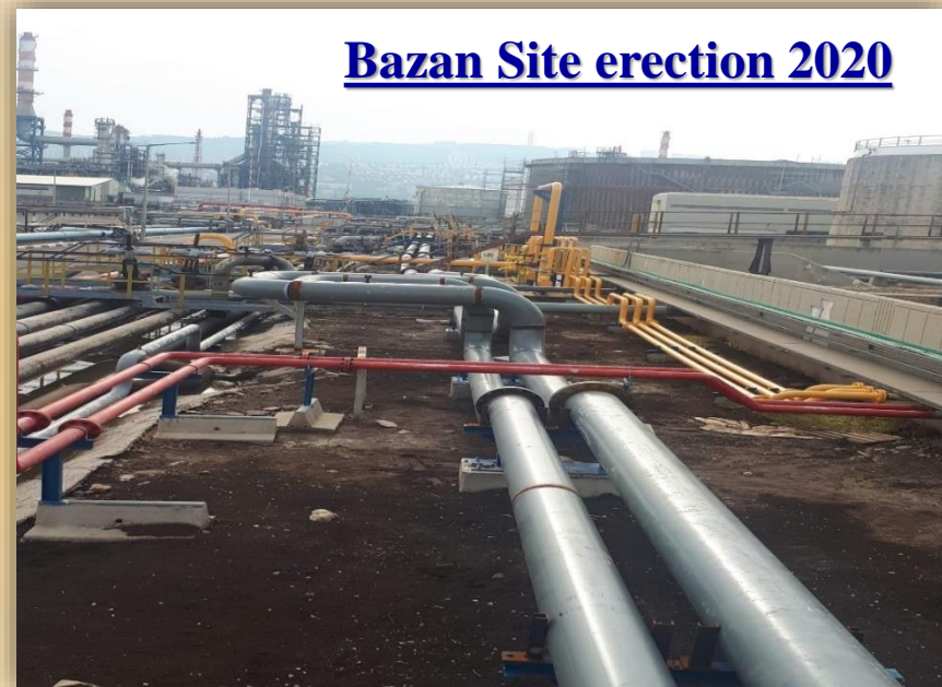
Bazan Site erection 2020