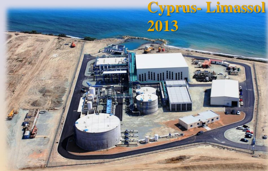
Cyprus- Limassol 2013