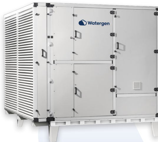
GEN-L Up to 6,000 liters/day