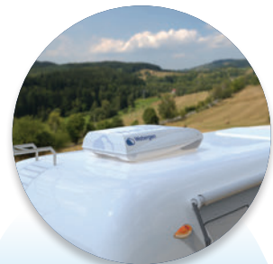
WATERGEN ON BOARD Up to 50 liters/day