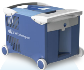
WATERGEN MOBILE BOX Up to 20 liters/day