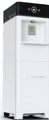
GENNY Up to 30 liters/day