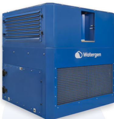
GEN-M Up to 800 liters/day