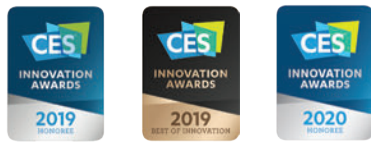
Best of Innovation

Watergen was recognized for its innovative technology & products and was granted multiple international awards