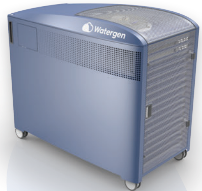
GEN-M1 Up to 220 liters/day