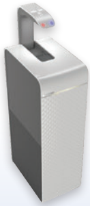
GENNY HOME Up to 18 liters/day