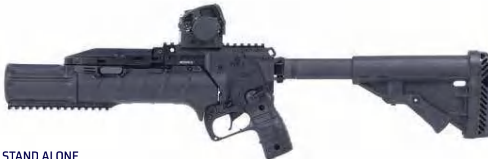
IWI GL 40 STAND ALONE 40X46mm grenade launcher 228.5mm or 305mm barrel length

AVAILABLE AS STAND ALONE GRENADE LAUNCHER