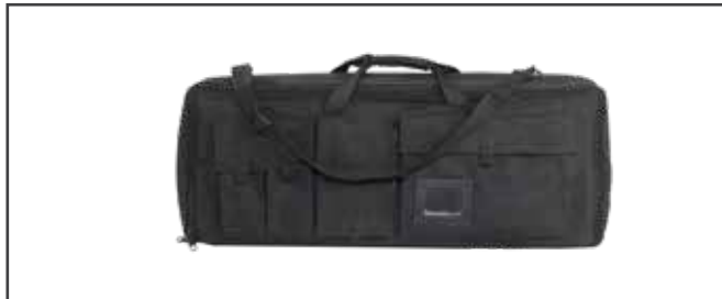
TACTICAL CARRYING BAG (including sniper's mattress)