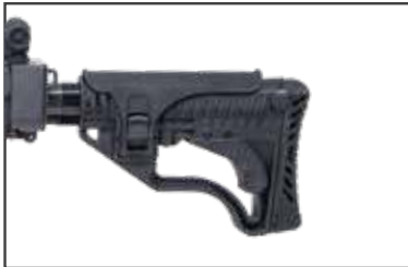
TELESCOPIC BUTT STOCK