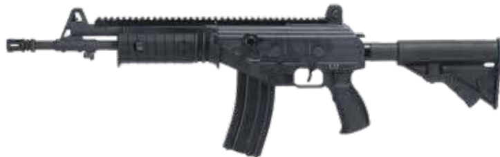
ACE 22 5.56X45mm Assault Rifle 335mm barrel length