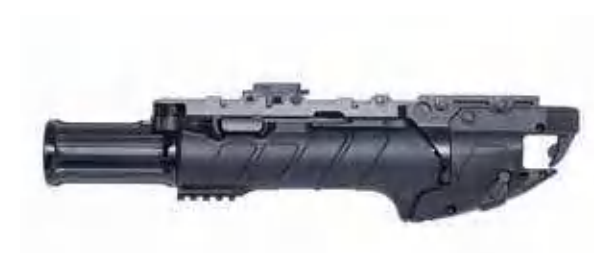
ACE IWI GL 40 40X46mm grenade launcher 305mm barrel length

The IWI UBGL 40 is available in 228.5mm and 305mm barrel length.