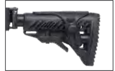
TELESCOPIC BUTT STOCK