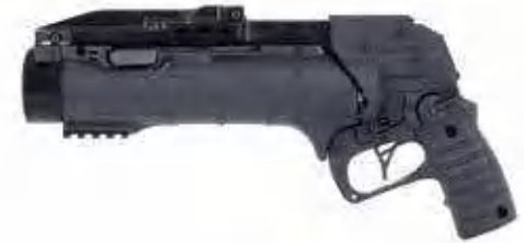
X95 IWI GL 40 SHORT 40X46mm grenade launcher 228.5mm barrel length

AVAILABLE AS STAND ALONE GRENADE LAUNCHER