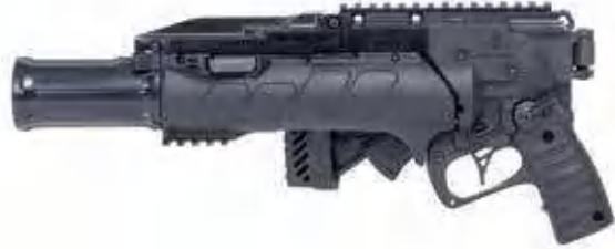
FOLDABLE BUTT STOCK