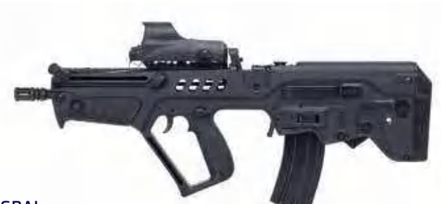
TAVOR CTAR INTEGRAL 5.56X45mm Assault Rifle, with integral MEPRO MOR reflex sight (available with diverse sights)