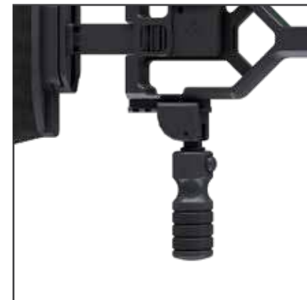
FOLDABLE & ADJUSTABLE MONO-POD