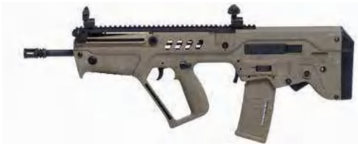
TAVOR TAR FLATTOP 5.56X45mm Flattop Assault Rifle