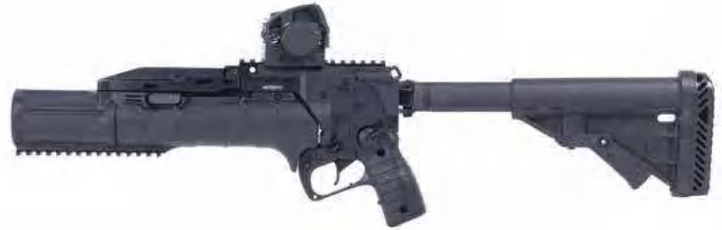
TELESCOPIC BUTT STOCK AND MEPRO GLS SIGHT

FOR SIGHTS, OPTICS AND OPTIONAL ACCESSORIES: SEE PG. 108