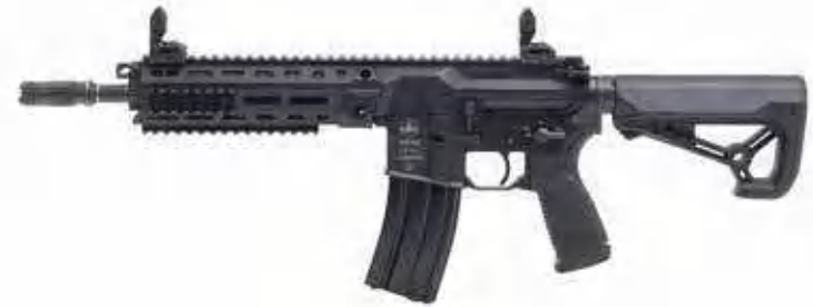
ARAD 300 BLK 300 BLK Assault Rifle 241mm barrel length