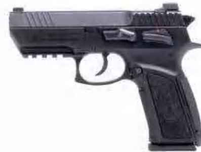
JERICO II-M 9X19mm 97mm barrel length