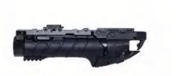
ACE IWI GL 40 SHORT 40X46mm grenade launcher 228.5mm barrel length