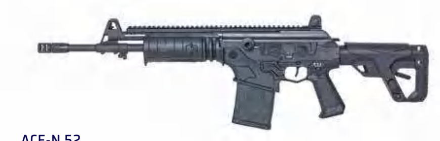
ACE-N 52 7.62X51mm Assault Rifle 409mm barrel length

The ACE 7.62X51mm models offer the ideal solution comprising a modern and reliable weapon suitable for long range targets in open and urban areas.