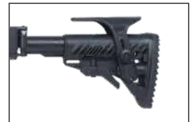
ADJUSTABLE CHEEK REST