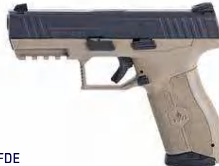
MASADA FDE with fixed 3-dot tritium sight