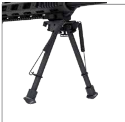
FOLDABLE & ADJUSTABLE BIPOD