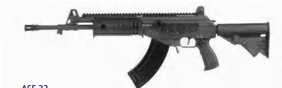
ACE 32 7.62X39mm Assault Rifle 409mm barrel length