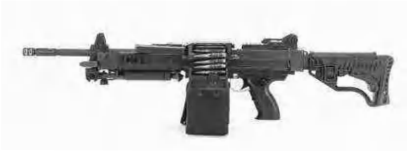
NEGEV NG-7 SF 13 7.62X51mm LMG 330mm barrel length