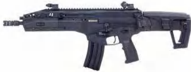
CARMEL 10.5 5.56X45mm Assault Rifle 267mm barrel length