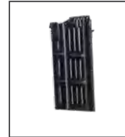
MAGAZINE 10 / 25 round