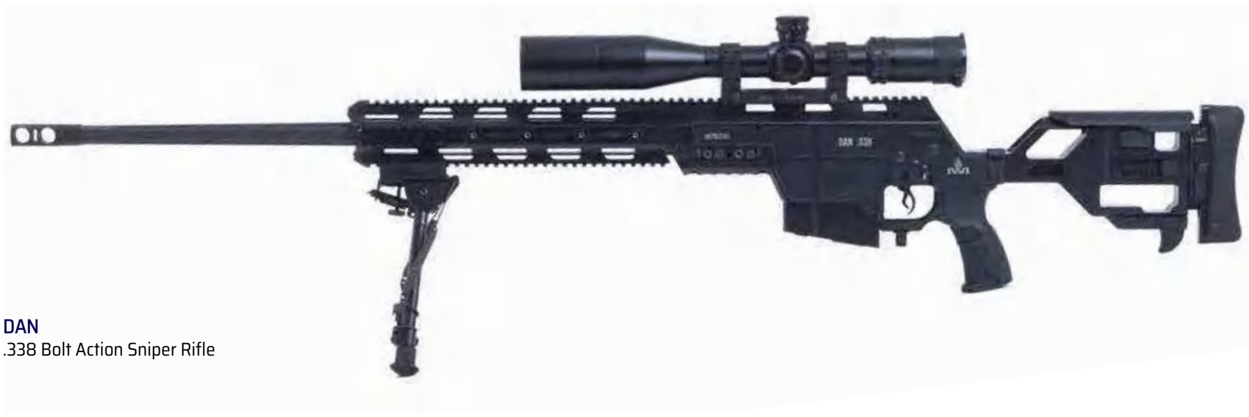
DAN .338 Bolt Action Sniper Rifle