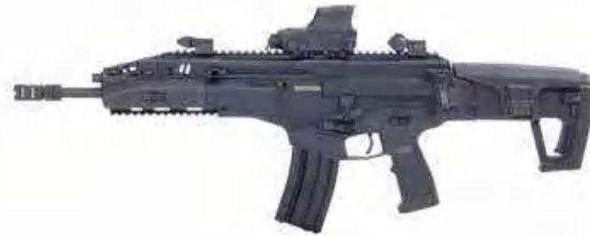
CARMEL 12 5.56X45mm Assault Rifle 305mm barrel length