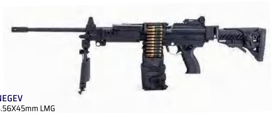
NEGEV 5.56X45mm LMG 460mm barrel length

The NEGEV LMG, deployed by the IDF, fired from an open bolt, can be fed using a belt, assault drum or NATO magazine.