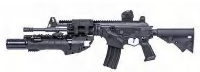
ACE-N 22 WITH IWI UBGL 5.56X45mm Flattop Assault Rifle with IWI 40mm UBGL