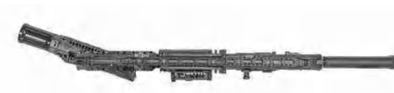
SIDE OPENING BARREL (TOP VIEW)