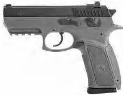
JERICO PSL 9X19mm 97mm barrel length, safety on the frame