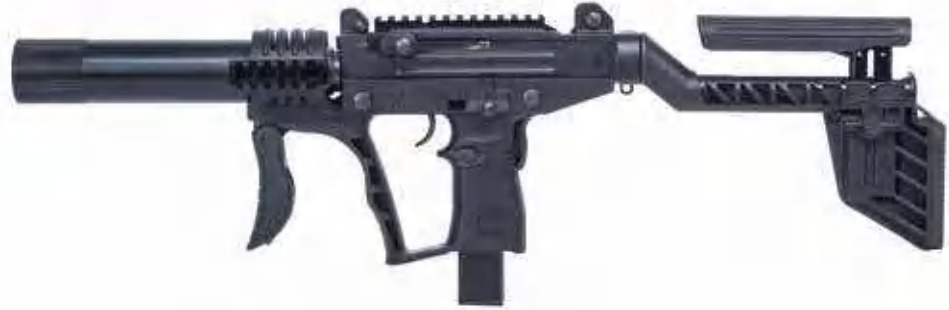
FOLDABLE ASSAULT GRIP & ADJUSTABLE CHEEK REST (SUPPRESSOR- OPTIONAL)