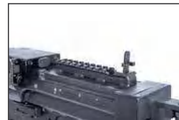
FLIP UP BACK-UP IRON SIGHT