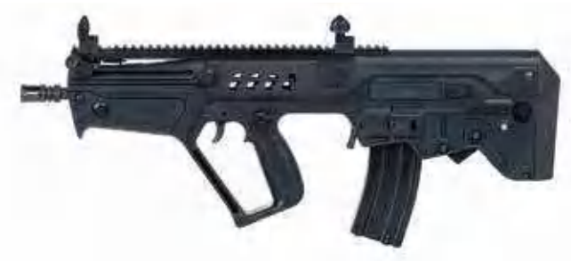
TAVOR CTAR FLATTOP 5.56X45mm Flattop Assault Rifle