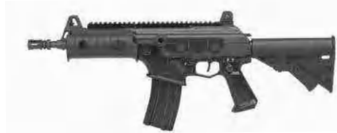
ACE-N 21 5.56X45mm Flattop Assault Rifle / Carbine 216mm barrel length