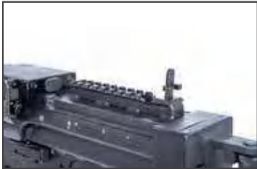
FLIP UP BACK-UP IRON SIGHT