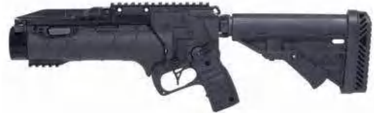
STAND-ALONE IWI GL 40 SHORT 40X46mm grenade launcher 228.5mm barrel length