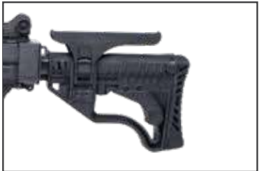
ADJUSTABLE CHEEK REST