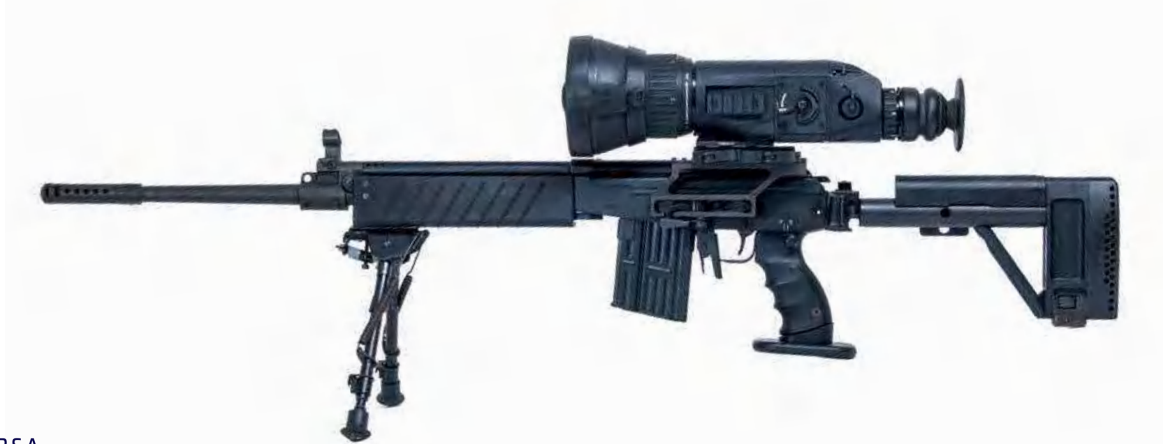
GALIL SNIPER S.A. 7.62X51mm with MEPRO NOA 7X uncooled thermal sight with x7 Magnification