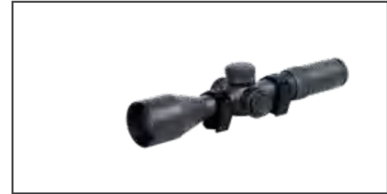
COMPATIBLE WITH DIFFERENT TELESCOPES Magnification up to x27