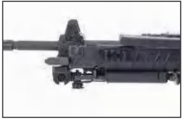
SIDE PICATINNY RAIL