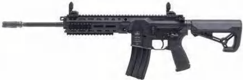
ARAD 14.5 5.56X45mm Assault Rifle 368mm barrel length