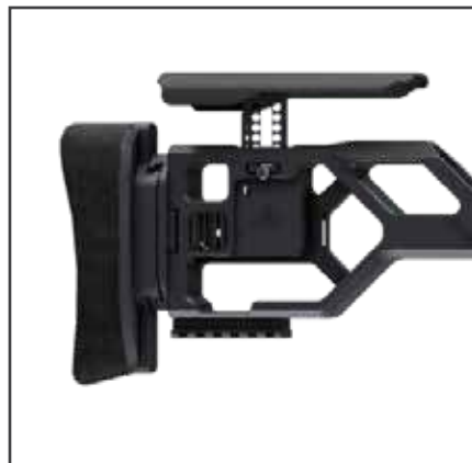
ADJUSTABLE CHEEK REST