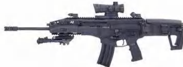
CARMEL 16 5.56X45mm Assault Rifle 406mm barrel length