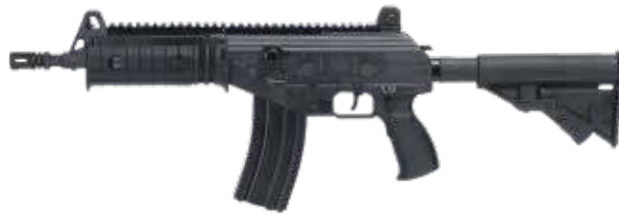
ACE 21 5.56X45mm Assault Rifle / Carbine 216mm barrel length