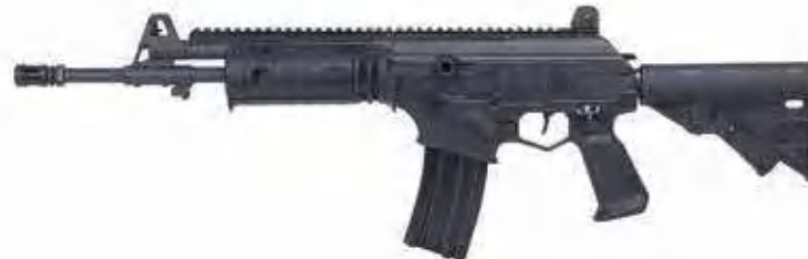
ACE-N 22 5.56X45mm Flattop Assault Rifle 335mm barrel length