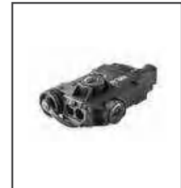
MEPRO STING Dual wavelength laser pointer