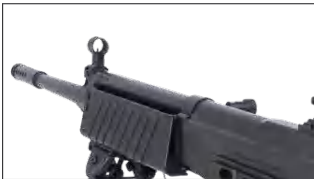
REAR & FRONT BACK-UP SIGHTS