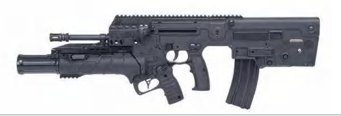
X95 FLATTOP 419 WITH IWI GL 40