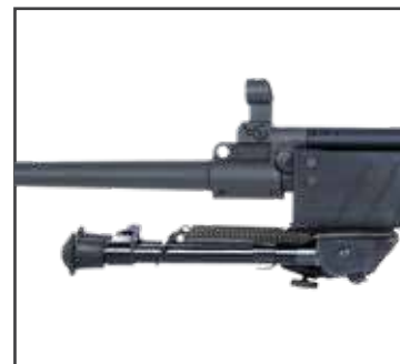
FOLDABLE & ADJUSTABLE BIPOD