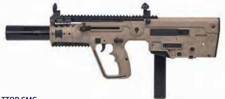
X95-S FLATTOP SMG 9X19mm Flattop SMG 279mm barrel length and suppressor