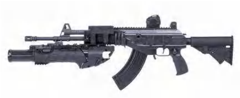
ACE 32 WITH IWI UBGL 7.62X39mm Assault Rifle with IWI 40mm UBGL