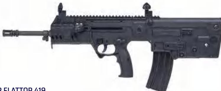
X95-R FLATTOP 419 5.45X39mm Flattop Assault Rifle 419mm barrel length