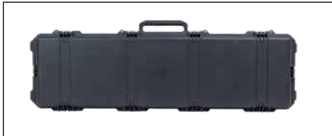
TACTICAL CARRYING CASE