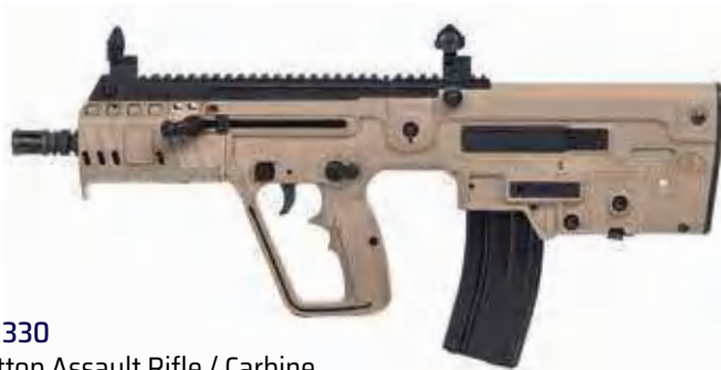
X95-R FLATTOP 330 5.45X39mm Flattop Assault Rifle / Carbine 330mm barrel length