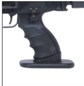
ADJUSTABLE HAND GRIP