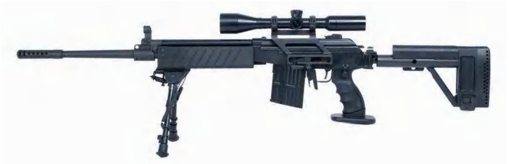
GALIL SNIPER S.A. 7.62X51mm with x10 day telescope