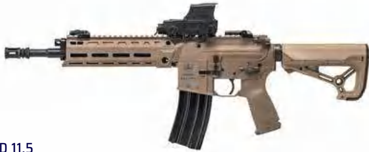
ARAD 11.5 5.56X45mm Assault Rifle 292mm barrel length