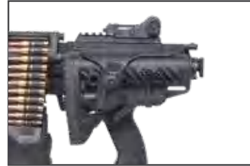
FOLDABLE BUTT STOCK

NEGEV SF 5.56X45mm LMG 330mm barrel length suitable with 5.56X45mm NATO magazine