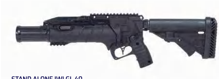
STAND ALONE IWI GL 40 40X46mm grenade launcher 305mm barrel length

The Stand-Alone IWI GL 40 is available in 228.5 mm and 305mm barrel length.