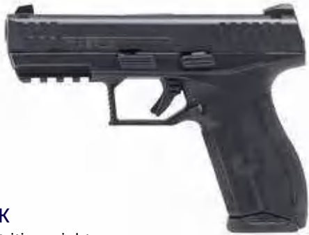
MASADA BLACK with fixed 3-dot tritium sight

FOR SIGHTS, OPTICS AND OPTIONAL ACCESSORIES: SEE PG. 108