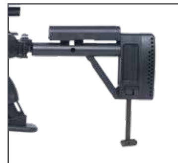
ADJUSTABLE CHEEK REST & ADJUSTABLE BUTT MONOPOD