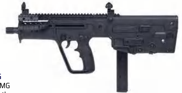
X95 FLATTOP SMG 9X19mm Flattop SMG 279mm barrel length