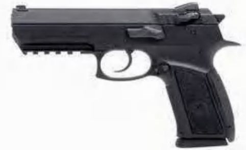
JERICO RPL 9X19mm 112mm barrel length, safety on the slide (decocker)