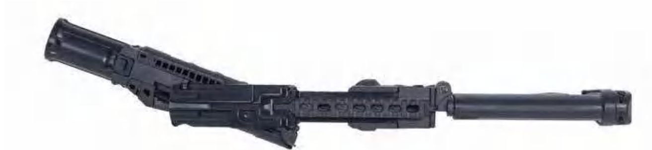
SIDE OPENING BARREL (TOP VIEW)