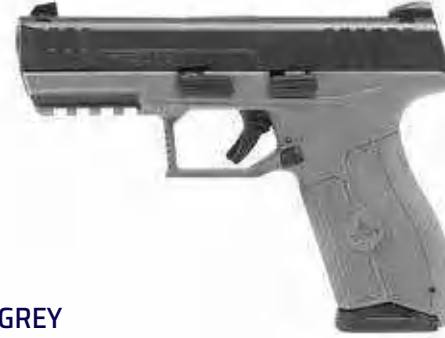
MASADA GREY with fixed 3-dot tritium sight