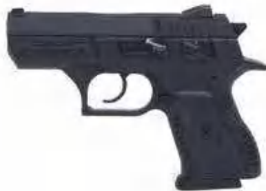
JERICO FBL 9X19mm 89mm barrel length, safety on the frame