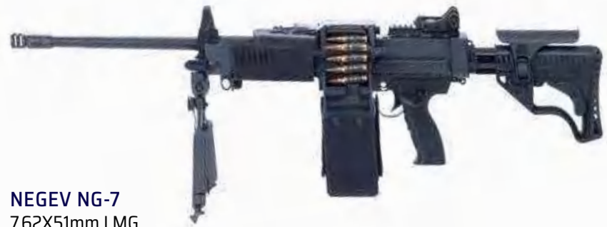
NEGEV NG-7 7.62X51mm LMG 508mm barrel length

The NEGEV NG-7 is based on the reliable and battle proven NEGEV 5.56 LMG, keeping its Semi-Auto ability and firing from an open bolt system. The NG7 can be fired belt fed or from an assault drum.