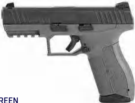
MASADA OD GREEN with fixed 3-dot tritium sight