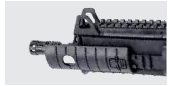
REMOVABLE GRIP WITH PICATINNY RAILS (BOTH SIDES)

FOR SIGHTS, OPTICS AND OPTIONAL ACCESSORIES: SEE PG. 108