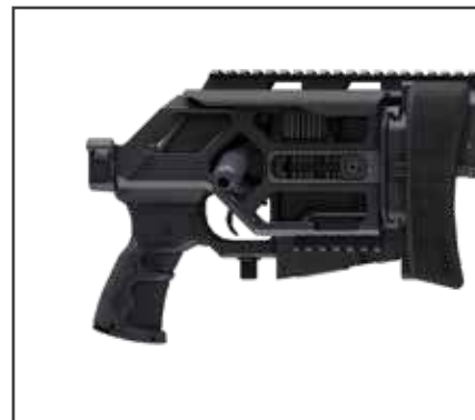
LIGHTWEIGHT FOLDING BUTT STOCK AND ADJUSTABLE LENGTH OF PULL