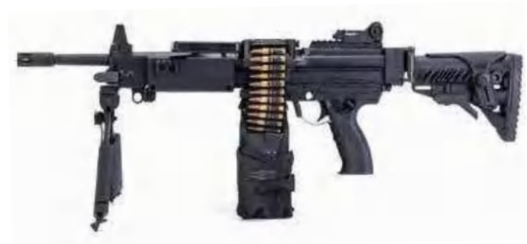
NEGEV SF 5.56X45mm LMG 330mm barrel length