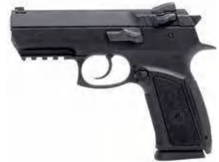
JERICO RPSL 9X19mm 97mm barrel length, safety on the slide (decocker)