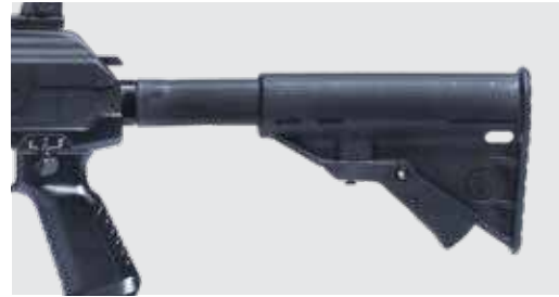
TELESCOPIC BUTT STOCK