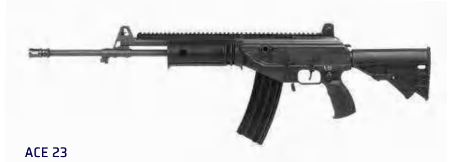
ACE 23 5.56X45mm Assault Rifle 463mm barrel length