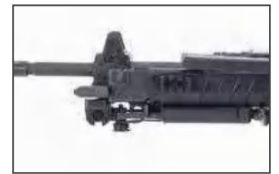
SIDE PICATINNY RAIL