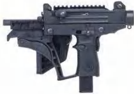
FOLDABLE BUTT STOCK