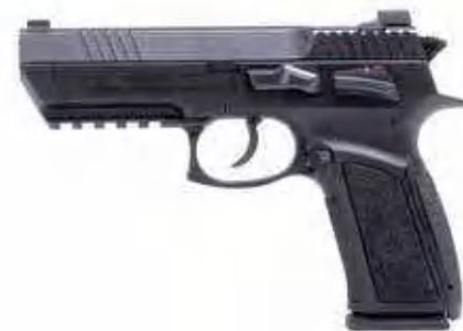
JERICO II 9X19mm 112mm barrel length