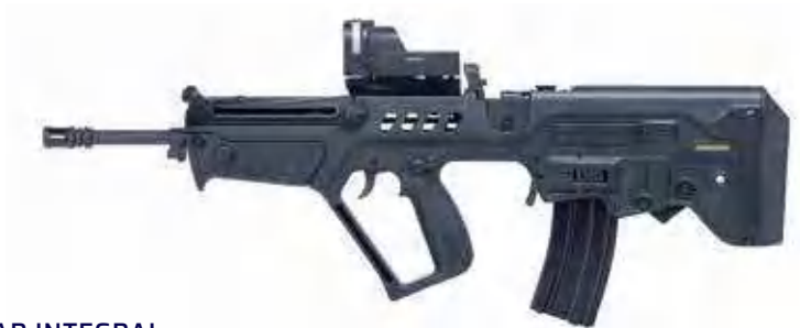
TAVOR TAR INTEGRAL 5.56X45mm Assault Rifle, with integral MEPRO 21 reflex sight (available with diverse sights)