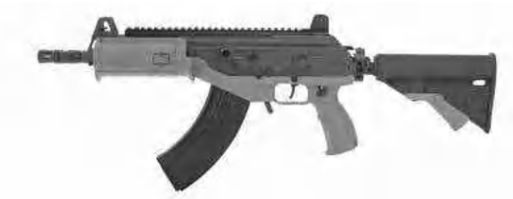
ACE 31 7.62X39mm Assault Rifle 216mm barrel length

The ACE 7.62X39mm models offer the ideal solution for military forces around the world transitioning their weapons to modern, innovative and high performance models without having to change their ammunition.