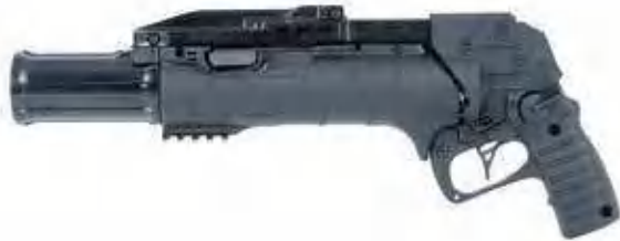
X95 IWI GL 40 40X46mm grenade launcher 305mm barrel length

THE IWI UBGL 40 IS AVAILABLE IN 228.5mm AND 305mm BARREL LENGTH