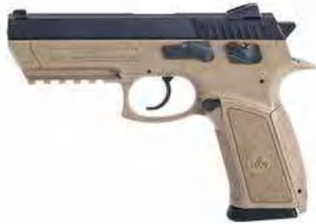
JERICO PL 9X19mm 112mm barrel length, safety on the frame