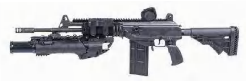
ACE 52 WITH IWI UBGL 7.62X51mm Flattop Assault Rifle with IWI 40mm UBGL