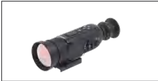
MEPRO NYX 90 Uncooled thermal sight with x7 magnification