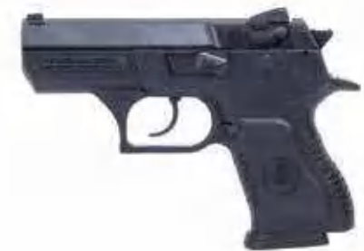
JERICO RBL 9X19mm 89mm barrel length, safety on the slide (decocker)