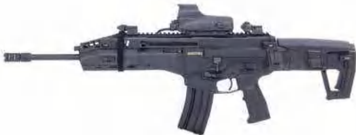
CARMEL 14.5 5.56X45mm Assault Rifle 369mm barrel length