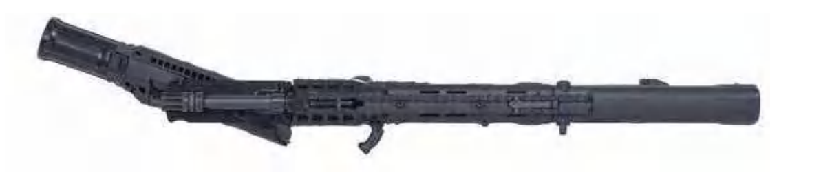
SIDE OPENING BARREL (TOP VIEW)