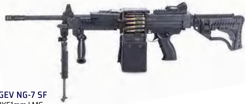
NEGEV NG-7 SF 7.62X51mm LMG 420mm barrel length