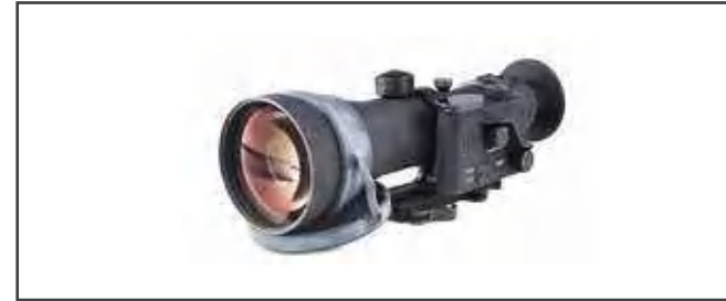
MEPRO HUNTER X4 / X6 Sniper's night vision sight with x4 or x6 magnification