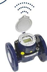
MEISTREAM CONNECT by SENSUS