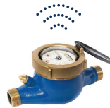
MVCONNECT by Madey Vered