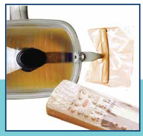
Antimicrobial Barrier Sleeve Covers