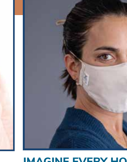
IMAGINE EVERY HOSPITAL TEXTILE HAVING BUILT-IN INFECTION CONTROL

99% VIRAL DEACTIVATION 99% BACTERIAL DEACTIVATION