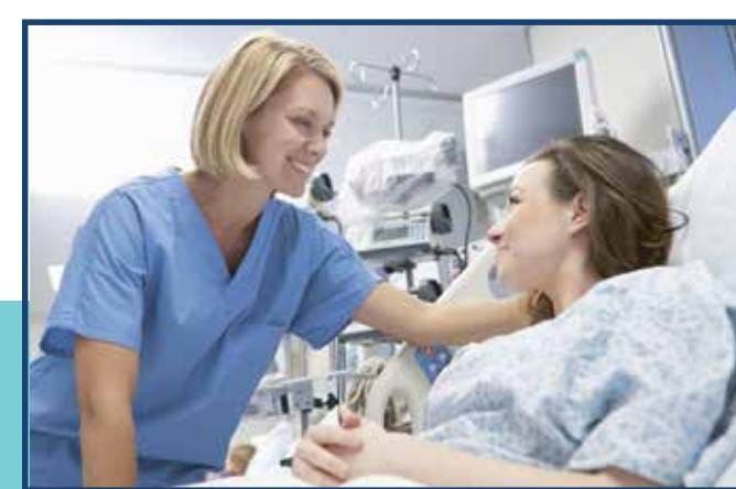
Proactive Hospital Uniforms

Argaman Technologies Ltd, Jerusalem, Israel +972-2650-5525 www.argamantech.com, info@argamantech.com