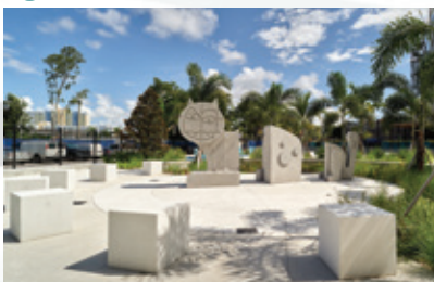
8 Outdoor activity center