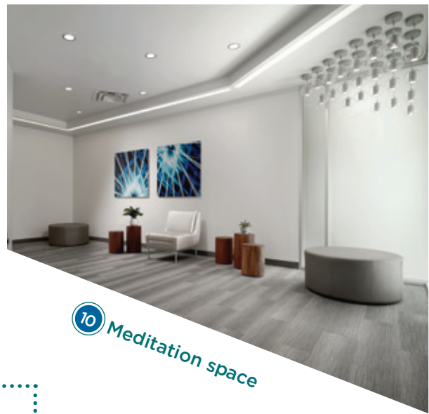
10 Meditation space