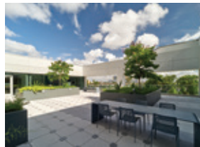
6 Outdoor terrace