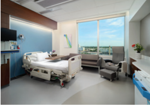
7 Inpatient suites