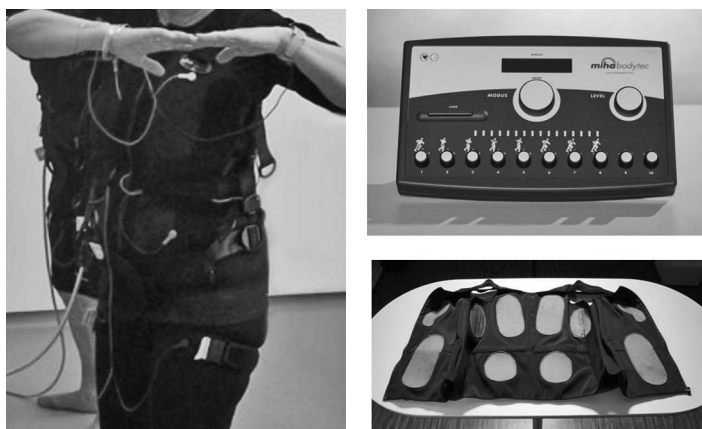
Figure 2. Whole-body electromyostimulation equipment.