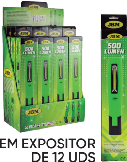
EM EXPOSITOR DE 12 UDS