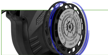
AUTO GUIDE REWIND SYSTEM