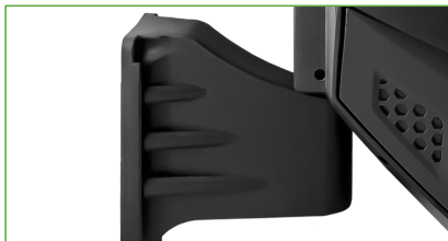
WITH WALL BRACKET