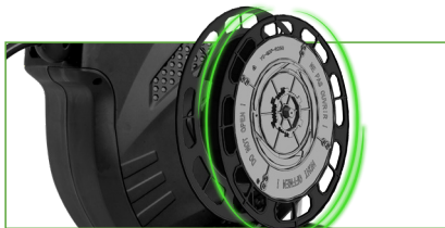
AUTO GUIDE REWIND SYSTEM