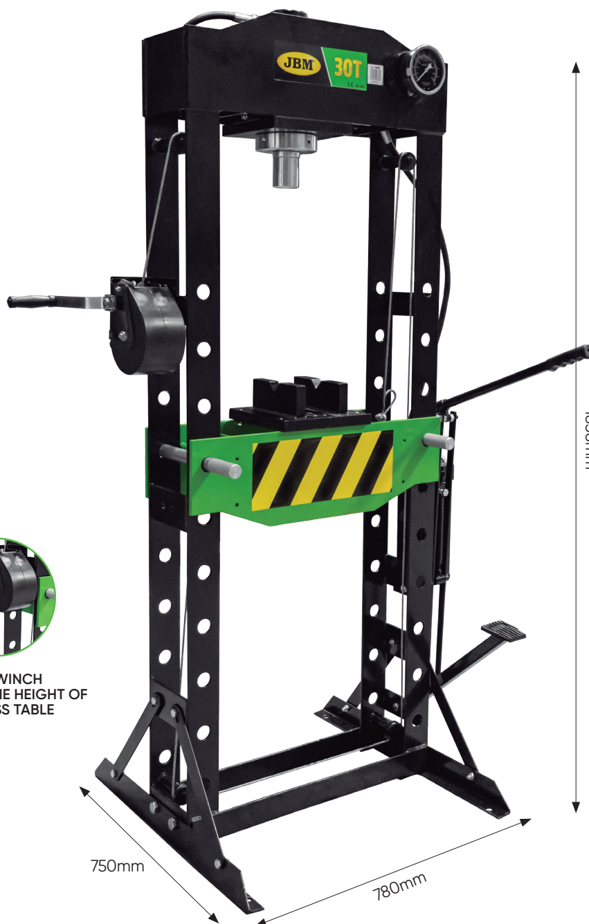
HAND LEVER AND FOOT PEDAL