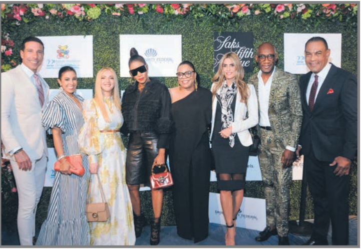
Foundation Board Member and Platinum Angel