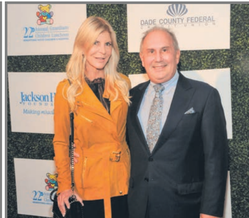
President, Jackson Health System