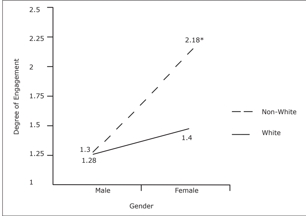
Figure 2. Interaction of gender and race related to degree of engagement

For the primary college appointments, we recoded Michigan State's 15 colleges into 8 more