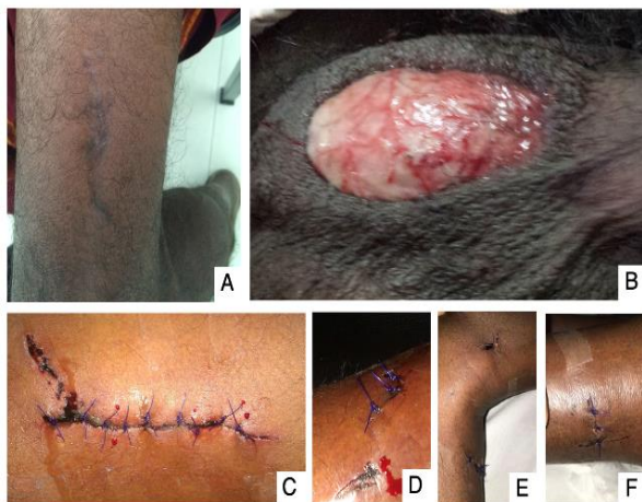
Figure 2: A. Healed laceration (An image taken at the time of the injury is not available), B. scrotal injury, C, D, E, F. Sutured laceration