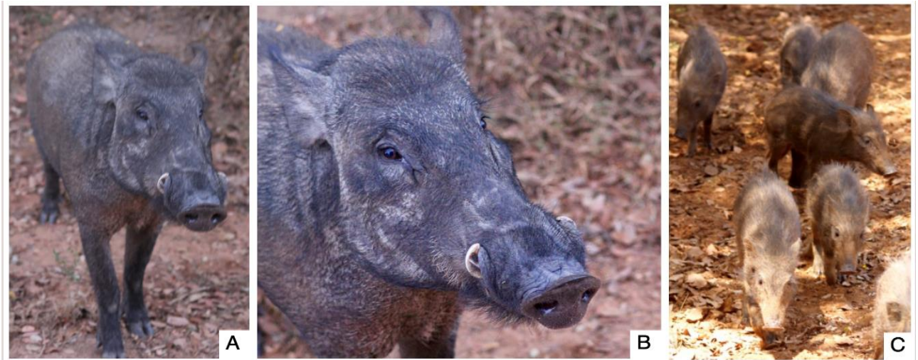
Figure 1: Sus scrofa cristatus A. adults, B. curved canine, C. piglets (Photographed by BW while on safari in a Yala National Park, Sri Lanka).