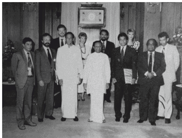
Fig 13: The American team which set up the Cardiothoracic Unit at SJGH with the then President Mr. Ranasinghe Premadasa