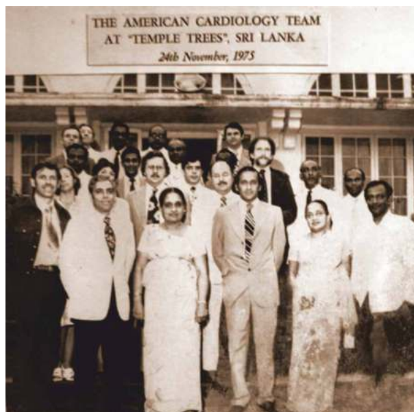
Fig 12: The American team which performed the first CABG operations in Sri Lanka photographed at Araliya Gaha Mandiraya with the then Premier Mrs. Sirimavo Bandaranaike