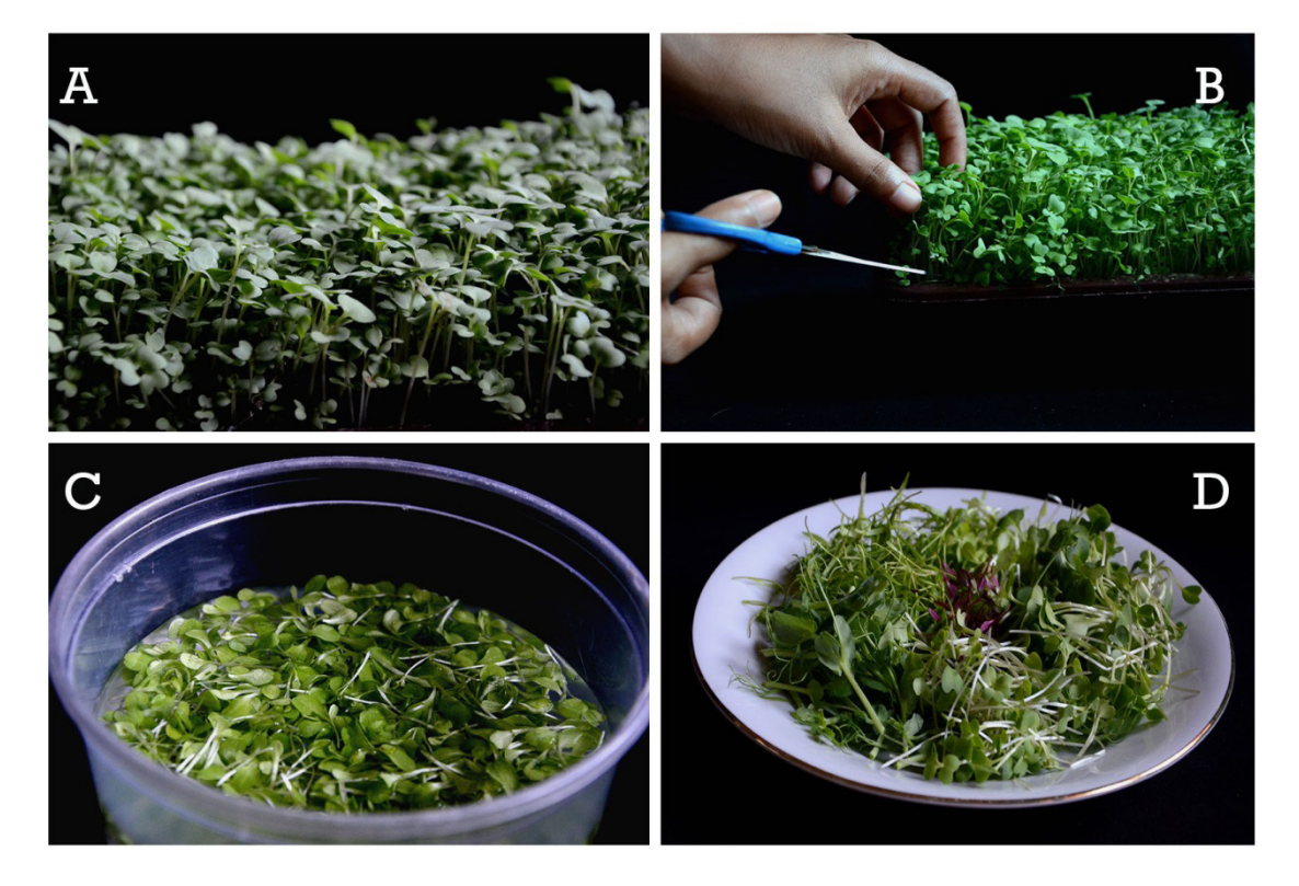
Figure 1: Steps involved in preparation of microgreen salads, A: microgreen at harvesting stage, B: harvesting microgreens, C: washing to remove plant debris and seed coat, D: Microgreen salad mix.

The same methanolic extract was used to determine total phenols (ISO, 2005), Folin Ciacalteu reagent (5.0 ml) (Loba Chemie, India) (10% v/v) was added to the aqueous sample (30% methanol) (1.0 mL) and after mixing well (3-8 min), 7.5 % Na<sub>2</sub>CO<sub>3</sub> (4.0 mL) was added, and incubated (60 min). Absorbance was measured at 765 nm. Total phenolics were expressed as gallic acid (Sigma-Aldrich, MO, USA) equivalents per 100 g dry weight basis of the sample.