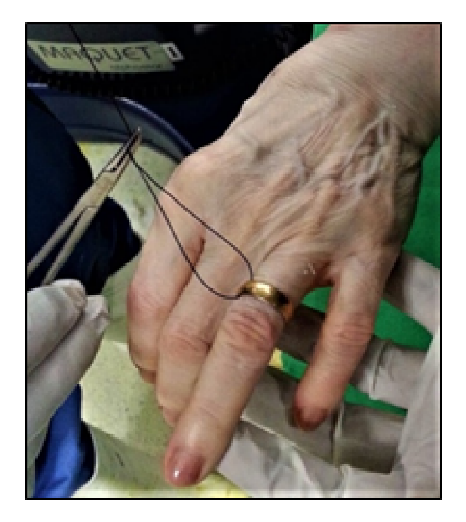
Figure 2. Artery forceps were used to hold the strings securely.