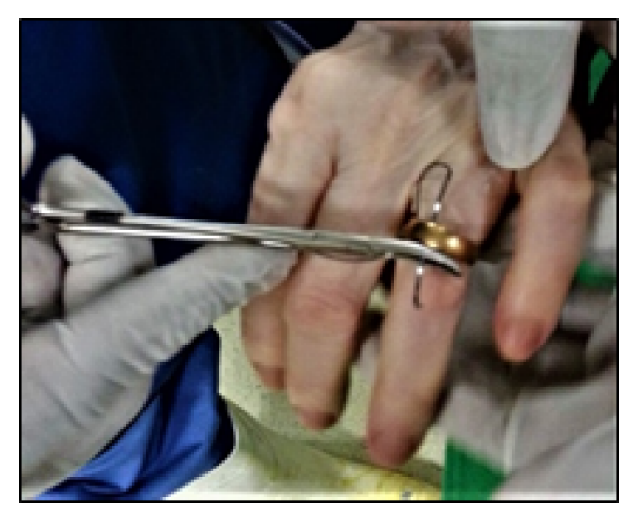
Figure 1. Following initial lubrication, blunt end of the curved needle with the nylon suture attached was passed under the ring.