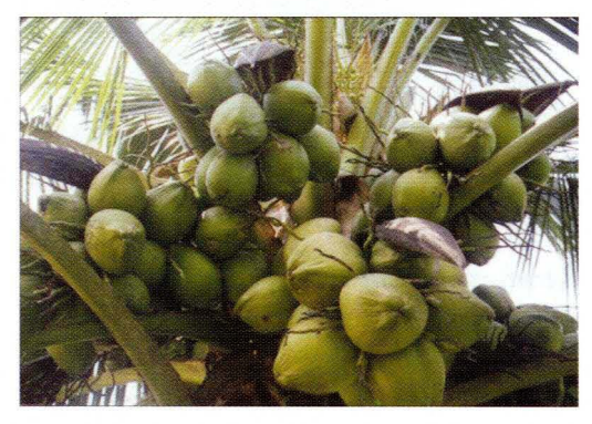
Plate 01: Crown of a resistant Sri Lanka Green Dwarf (Murusi) palm

Coconut varieties Sri Lanka tall (SLT) and Gon thembili tall (GTT) and several other phenotypes belonging to variety Typica , Sri Lanka Green dwarf (SLGD) (Plates 01 and 02) including Green dwarf 'Murusi' form (Ekanayake et al. 2010) and Sri Lanka Yellow dwarf (SLYD) belonging to variety Nana and King coconut (KC) from Intermediate coconut variety Aurantiaca were evaluated in the survey for resistance to WCLWD.