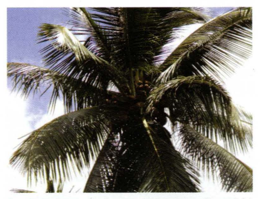
Plate 05: Resistant tall palm (resembling tall form Kamandala)

The resistance of the Typica variety GTT was higher than that of SLT. Out of a total of 22 individual GTT palms, 14 palms were healthy with a WCLWD resistance of about 63%. In addition to SLT and GTT there were certain other Typica individual genotypes which were healthy. Among them there was one prominent palm resembling the Kamandala form of variety Typica but with reddish brown ( rathi ) pericarp (Plate 05). It was observed that although the fruit of this coconut phenotype resembled Kamandala the nut within was smaller than typical Kamandala nuts.