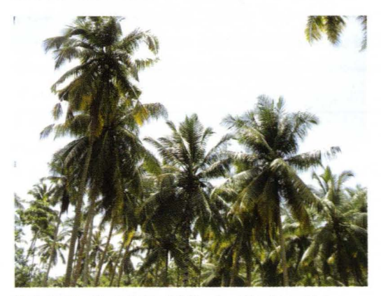
Plate 04: Healthy individual Sri Lanka tall palm amidst diseased palms

The resistance of the Typica variety GTT was higher than that of SLT. Out of a total of 22 individual GTT palms, 14 palms were healthy with a WCLWD resistance of about 63%. In addition to SLT and GTT there were certain other Typica individual genotypes which were healthy. Among them there was one prominent palm resembling the Kamandala form of variety Typica but with reddish brown ( rathi ) pericarp (Plate 05). It was observed that although the fruit of this coconut phenotype resembled Kamandala the nut within was smaller than typical Kamandala nuts.