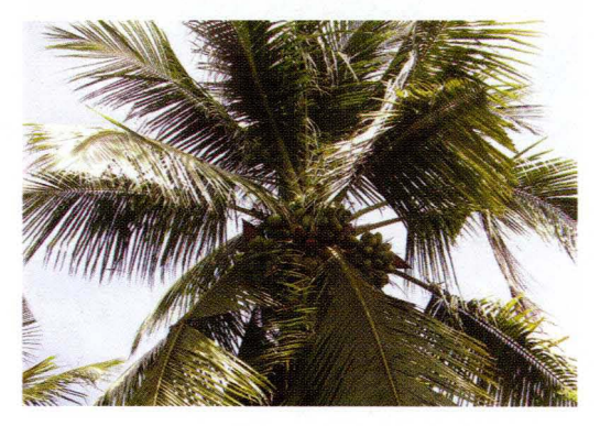
Plate 02: Resistant Sri Lanka Green Dwarf palm

The Nana coconut form, SLYD showed a fair degree of resistance to WCLWD but not as high as that of Sri Lanka Green dwarf. Out of a total of 27 SLYD coconut palms evaluated, 18 were observed to be disease free recording the second highest degree of resistance to WCLWD.