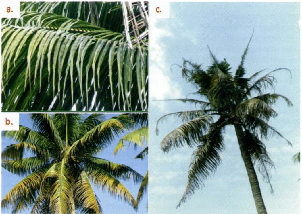
Fig. 1. Common morphological symptoms seen in WCLWD affected palms (a) Leaf flaccidity (b) intense leaf yellowing along with leaf flaccidity (c) Leaf rot affected palm.

affected area in 2006, a boundary was declared. The transportation of coconut based plant materials from the affected area was restricted. Moreover, all suspicious coconut palms were removed from the 3 km wide boundary which stretched from Galle to Tangalle via Imaduwa , Akuressa , Kirinda-Puhulwella , Hakmana , Walasmulla and Beliatta (Everard, 2013). Removal of affected palms was carried out in the core area too. The boundary was based on the main road structure (mainly the A17 route) which cuts across the major towns mentioned above. Three kilometer distance on either side of the road i.e. one kilometer distance outside the road and two kilometer distance inside the road was considered as the major boundary zone. Findings of preliminary experiments conducted in the affected area have revealed that the spread of the disease could be effectively controlled by the removal of disease affected