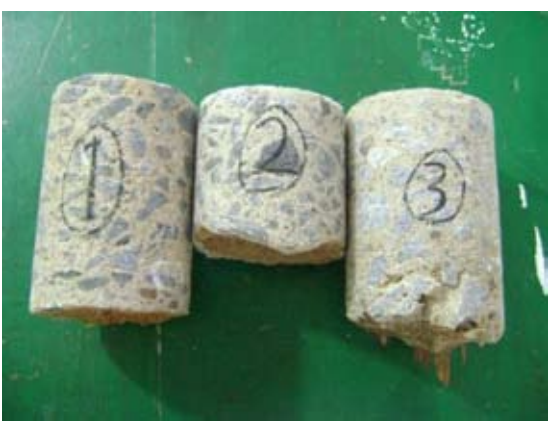
Figure 1- Concrete core samples

Rebound hammer can be used to measure surface hardness of concrete pavements where surface hardness correlates with strength of the pavement. However, surface hardness depends on various factors such as moisture condition of surface, aggregate size etc (BS 4408:PART 4) [6] It is advisable to use hammer test as a field test for quality control since it is possible to test the overall pavement. However, core sample testing should be conducted for quality assurance to verify the hammer results (strength) and the pavement thickness.