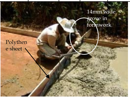
Figure 3 -Construction of half depth contraction joint