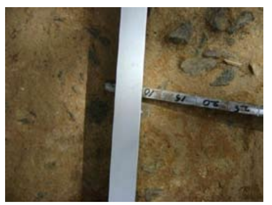
Figure 2 - Modified straight edge

Surface undulations were measured in selected roads in the Galle district after the field survey. Table 3 shows the data collected from Kahaduwa Milidduwa road in Galle. This road has been rated as a good surfaced road in the survey. It can be seen that undulations exceeded 10 mm only at three locations. This study shows that 10 mm of undulation can be allowed for rural road construction and it can be achieved with available resources.