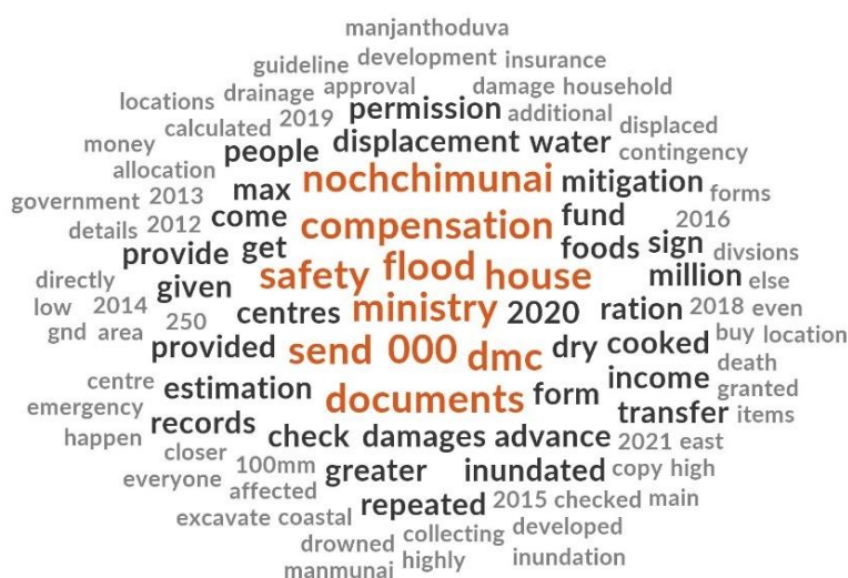
Figure 2: Word cloud obtained from DMC officer

Results obtained from the key informant interviews (Disaster Management Officer, Manmunai North, Batticaloa.)