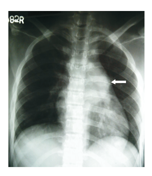
Figure 1: Retrocardiac shadow (arrow)

Preliminary investigations revealed pancytopaenia (Hb - 7g/dL, WBC - 6.1x10^9/L , platelet - 57x10^9/L ) and her peripheral blood film showed normal red cell morphology, leukopaenia and neutropaenia with some blast cells and moderately low platelets. The haematological findings suggested acute leukaemia. Bone marrow aspiration and trephine biopsy confirmed acute myeloid leukaemia with maturation (FAB AML M2). Chest radiograph showed retro cardiac shadow separated from cardiac border (Figure 1). An urgent Magnetic Resonance Imaging (MRI) of the spine showed paraspinal mass extending from T2 to T7. The mass extended into the spinal canal through left T4/T5 and T5/T6 exit foramina and there was an evidence of severe cord compression at the same level. Biopsy of the paraspinal mass under the ultrasound guidance was done and the histology was compatible with myeloid sarcoma.