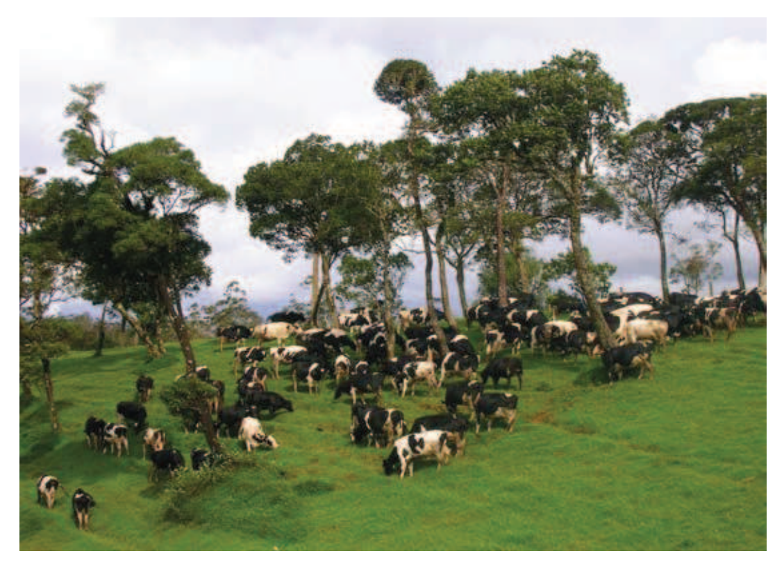
Figure 1: Friesian cattle grazing lush pastures in the hill country