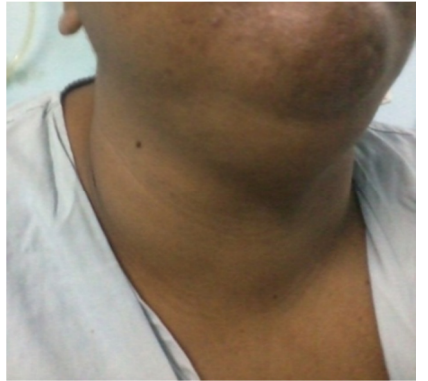
Figure 1: Preoperative patient.

tender swelling of size 8x5x3cm more on right side of the neck with a non palpable lower border was present. Both nostrils were partially obstructed. Mouth opening was 2 fingers, Mallampati grade IV, macroglossia and a thyromental distance of 6 cm. Pulse rate was 80/min, BP-130/80mmHg, RR-24/ min and SpO<sub>2</sub> of 96% on air. Mild grunting was present at rest. Systemic examination was normal except mental retardation.