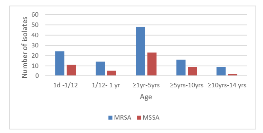
Figure 1: Distribution of MRSA and MSSA in different age

Figures 1-2 and Tables 2-3 show the characteristics of the MRSA and MSSA isolated from the study population.