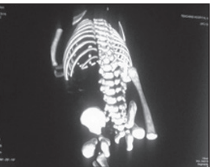
are the two widely accepted theories of forming conjoint twins.<sup>2</sup>

It is thought that vascular compromise causes tissue of the parasitic twin to become dependent on collaterals derived from the autosite. Compromised portion of the parasite undergoes selective ischaemic atrophy.<sup>2</sup>