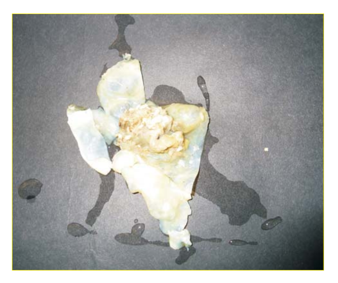
Figure 1. Gross specimen of a hydatid cyst of the parotid gland