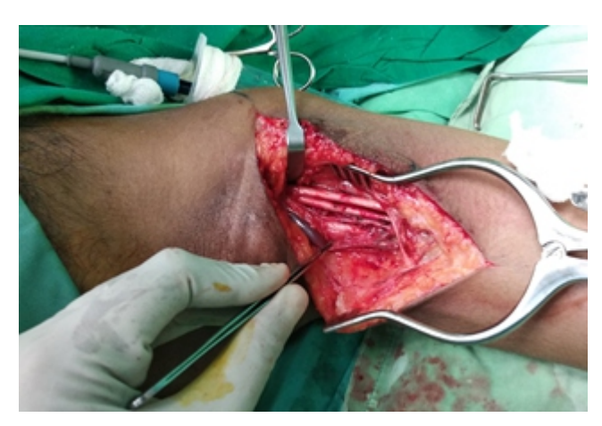
Figure 1. Proximal end of the gracilis myocutaneous flap anchored to the coracoid process